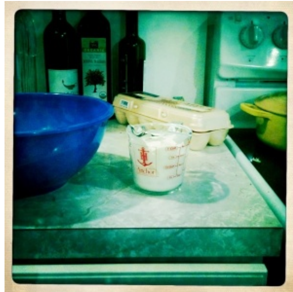
Prepping for Cheesecake

Torah on the first night of Shavuot. This ultimate all nighter is seen as an embodiment of the acceptance.