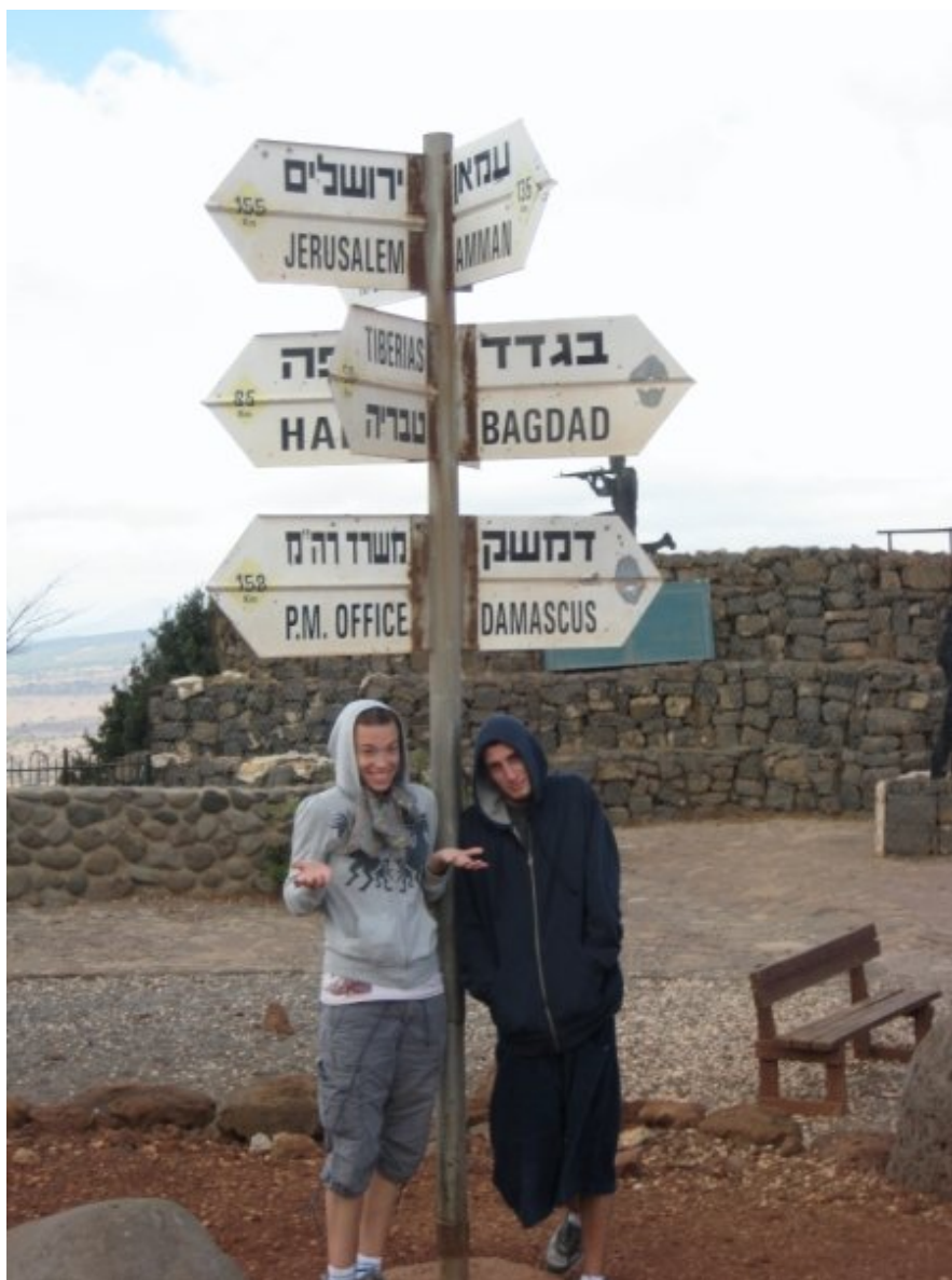
Decisions, decisions. Future-husband and I at the Israeli/Syrian border in 2007.

belly laugh. And with that silly joke, deep breaths were had, green shakshuka was ordered and 2 years later, I married their son.