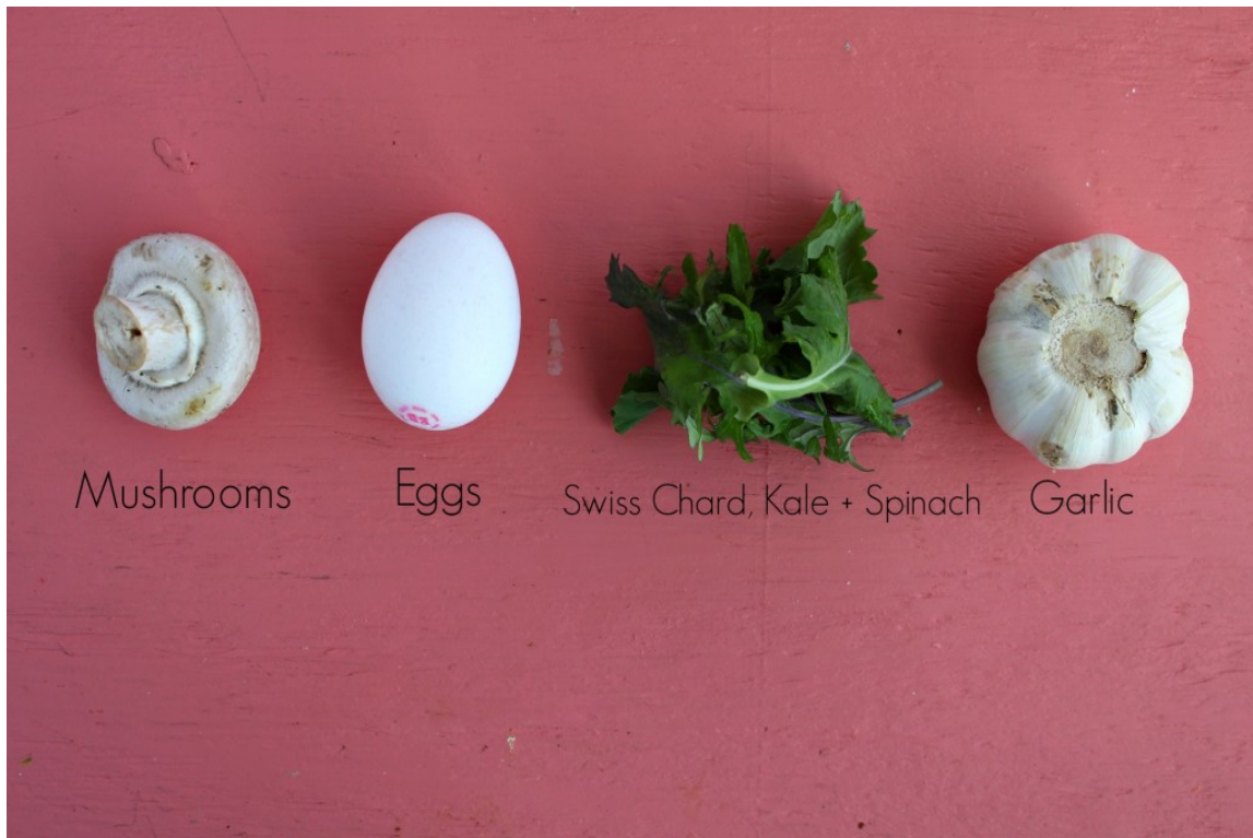
Some of your players