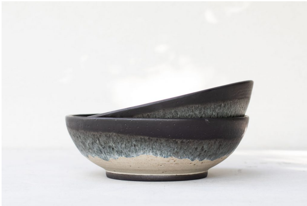
Ceramic bowls by Irit Biran