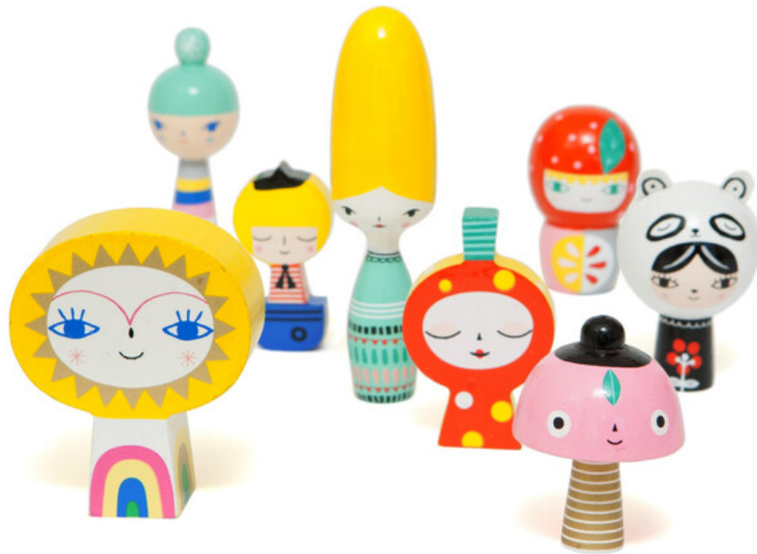
Wooden dolls by Suzy Ultman