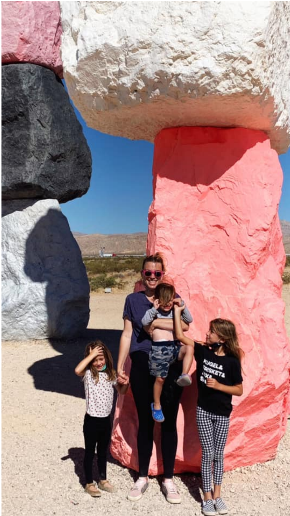
Pit stop outside of Vegas, baby.