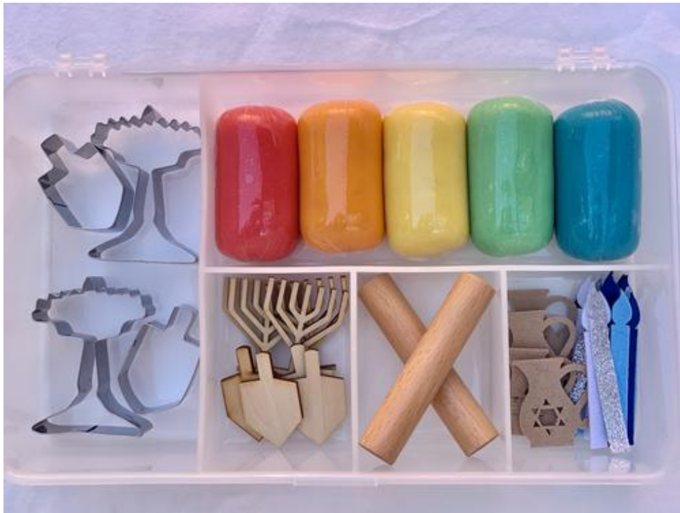
A kosher kit box