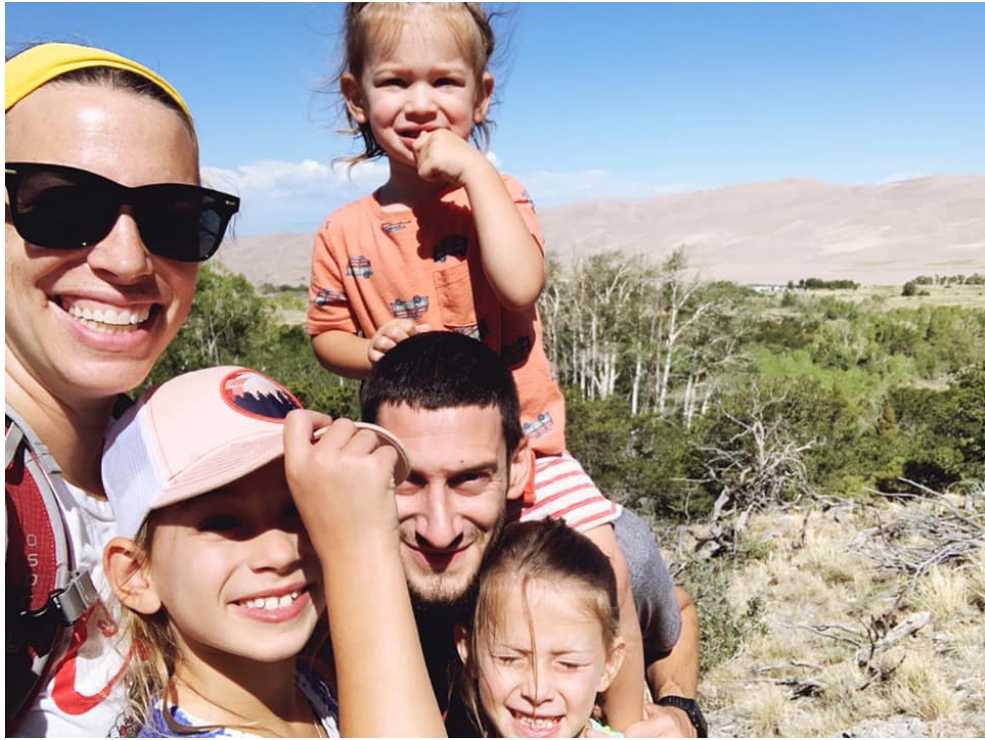
Hiking in Grand Sand Dunes.