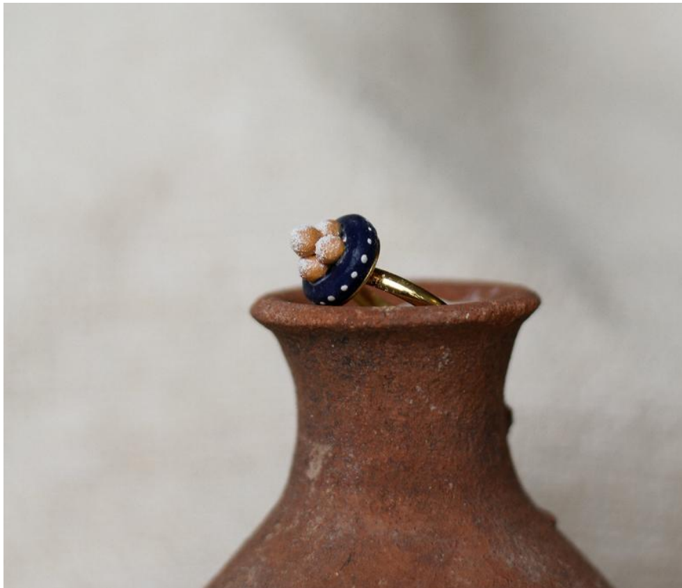
Bimuelos ring by Shuk n' Chic.