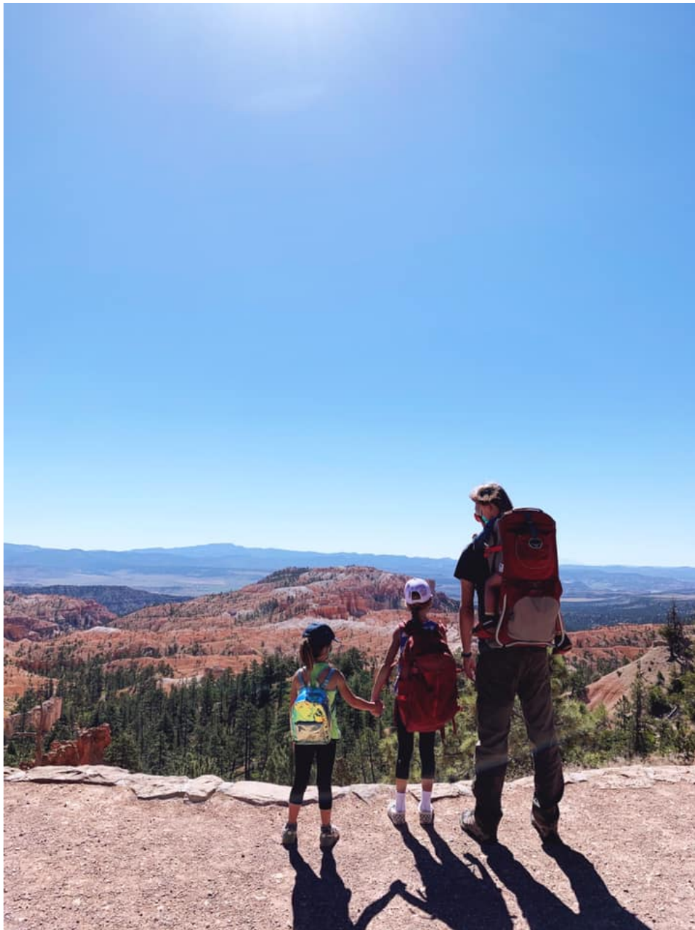
Hiking in Bryce Canyon National Park