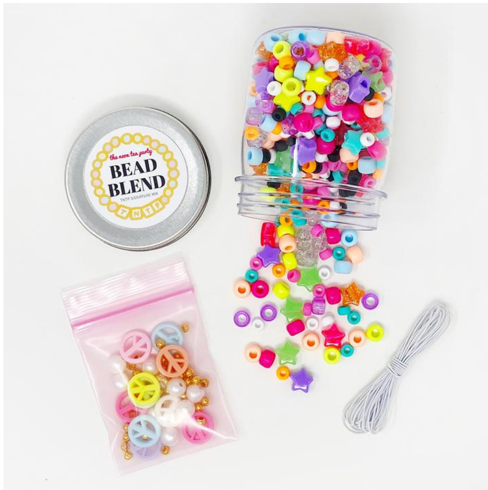
Custom bead blend from The Neon Tea Party.

And, not for nothing, but you can buy some of these artists' wears and you can also donate to support the Hillel that I oversee. I'm working hard to create a safe, inclusive Jewish space in Oxford, Ohio where Jewish college students can learn, grow, and become the future Jewish leaders we need them to be. Donate here to help further this work. Thanks for reading and Happy Thanksgiving.