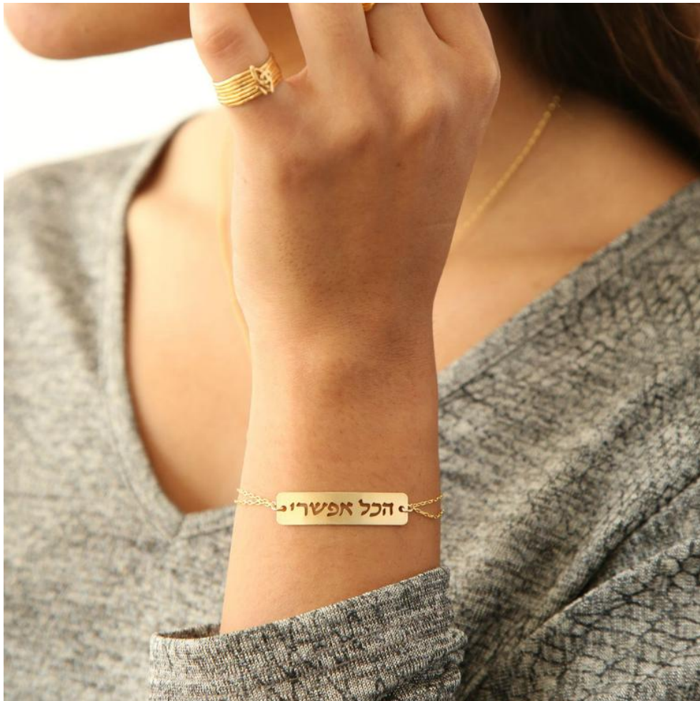
Bracelet in Hebrew by Maydelle Jewelry.