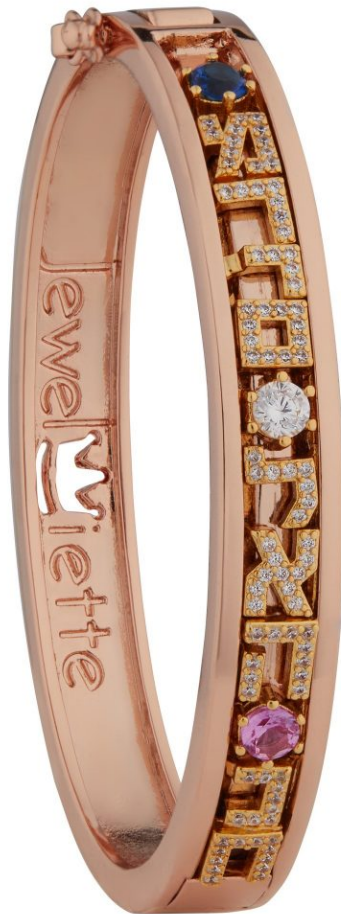
Rose gold bangle bracelet by Jewelette.