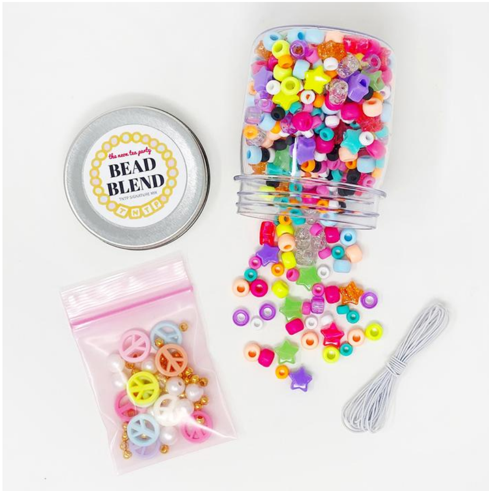
Custom bead blend from The Neon Tea Party.

And, not for nothing, but you can buy some of these artists' wears and you can also donate to support the Hillel that I oversee. I'm working hard to create a safe, inclusive Jewish space in Oxford, Ohio where Jewish college students can learn, grow, and become the future Jewish leaders we need them to be. Donate here to help further this work. Thanks for reading and Happy Thanksgiving.