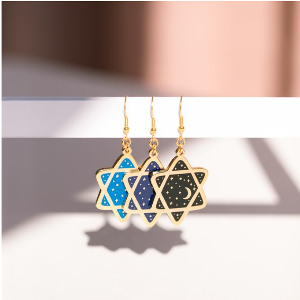
Star of David earring by Sarah Day Arts.