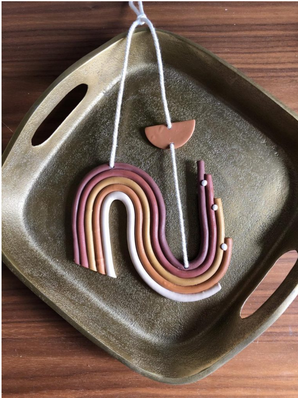
Wall hanging by Olivia from The Creative Native