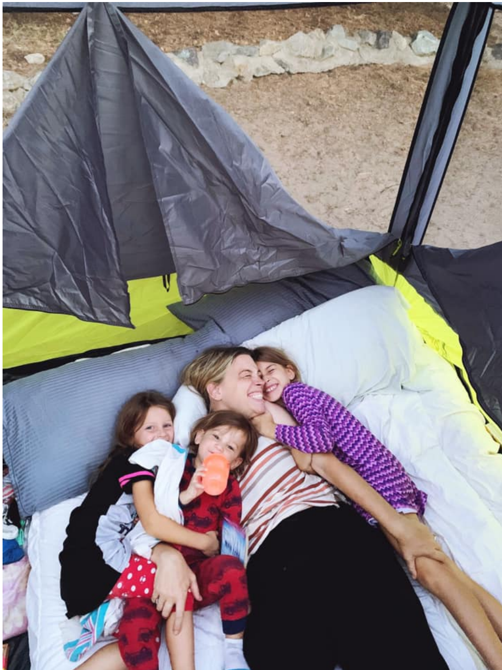
Camping in Great Sand Dunes National Park.