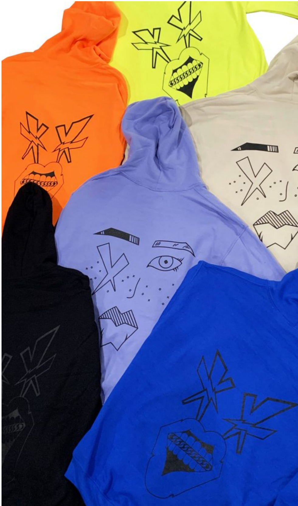
BEAT by Elliot Saeidy