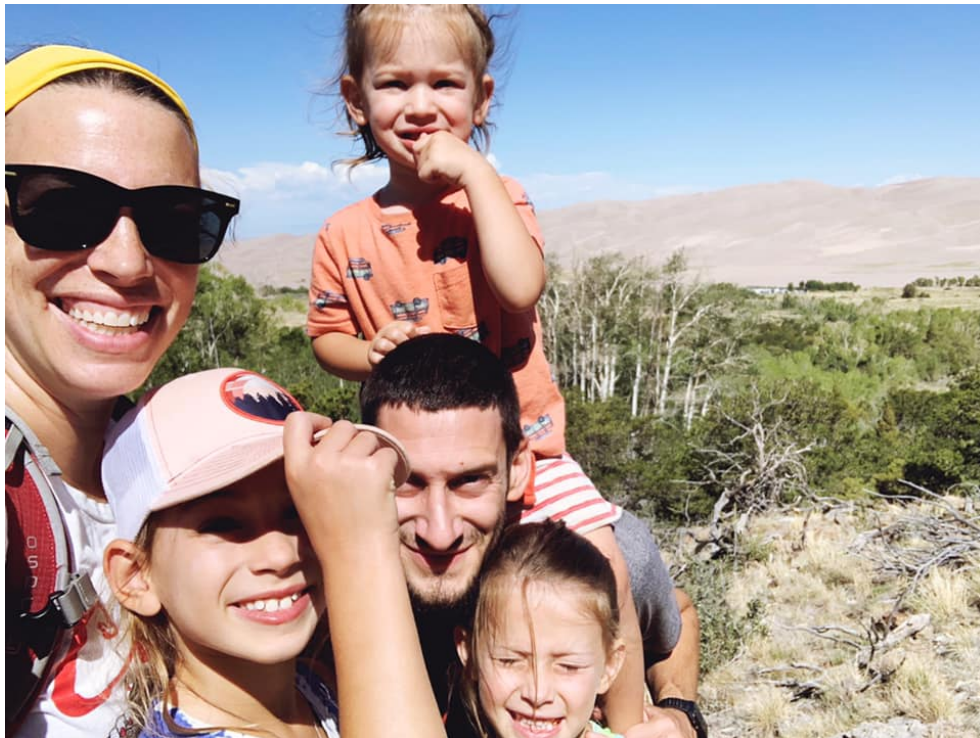
Hiking in Grand Sand Dunes.