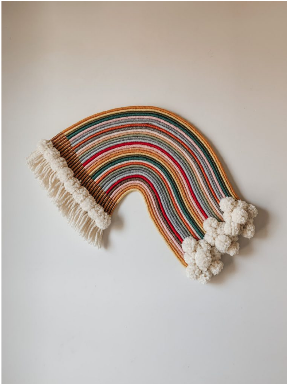
Giant rainbow wall art by Wolf.Dew