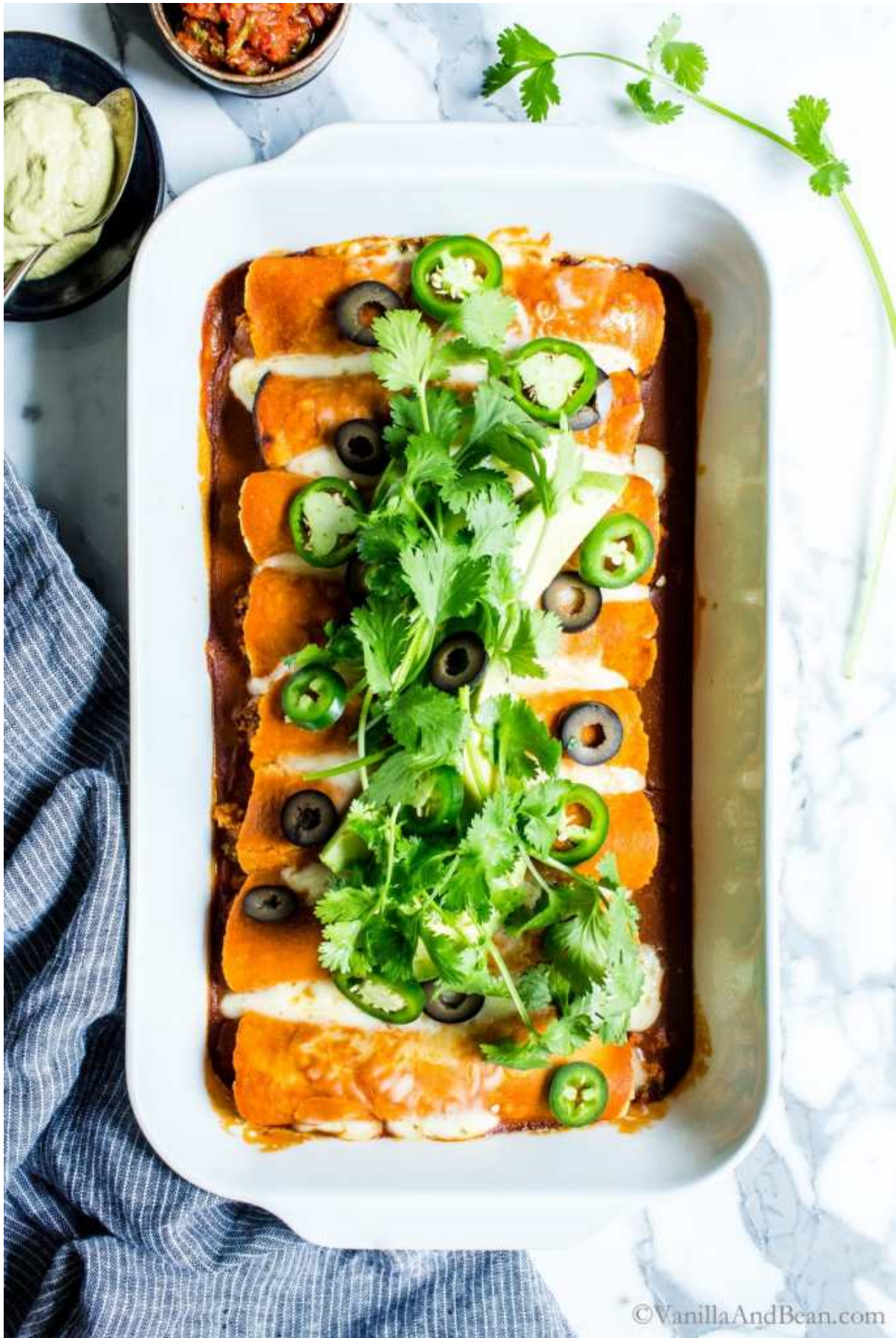
Cheesy Vegetarian Tofu Enchiladas from Vanilla and Bean