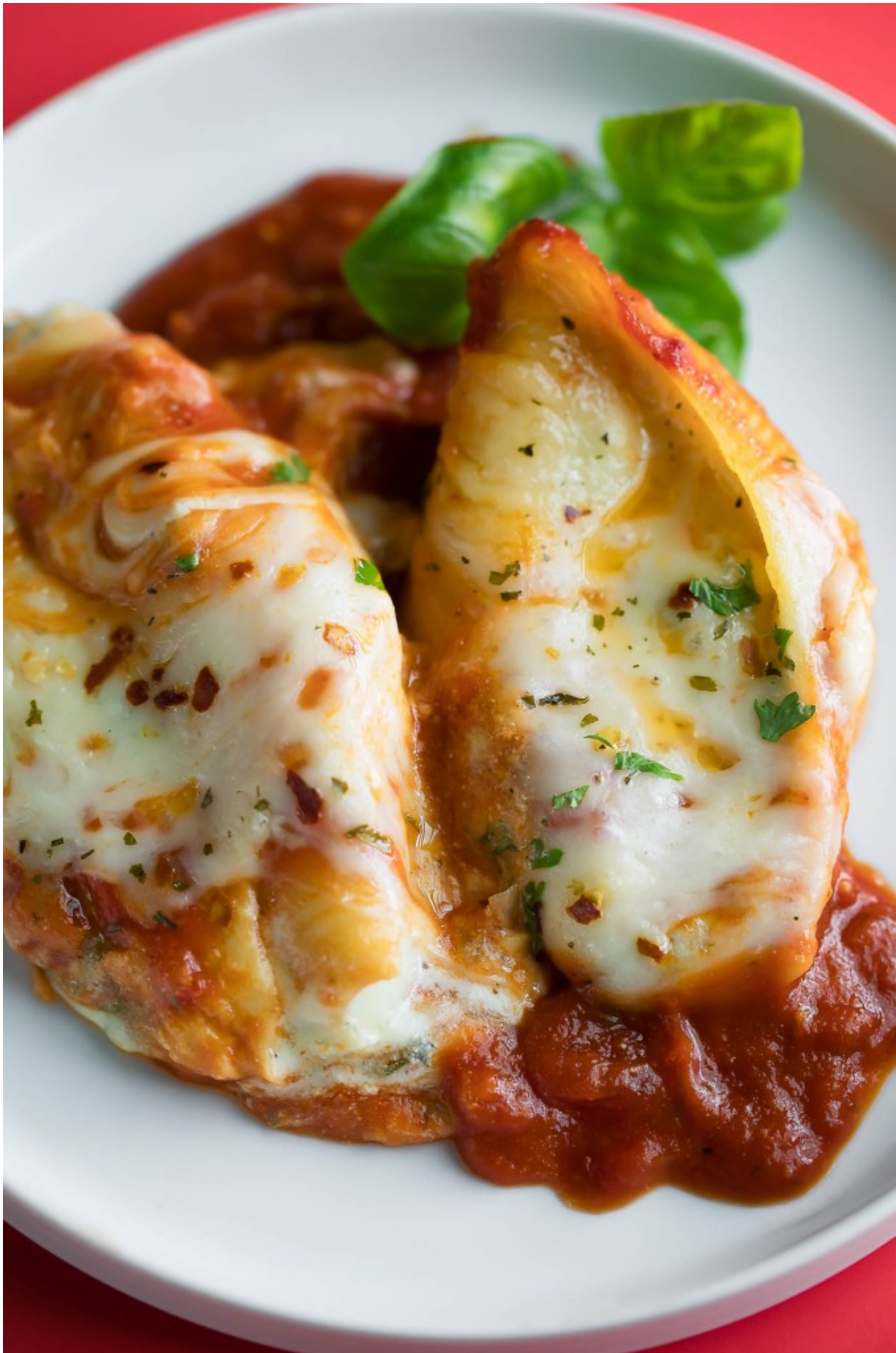
Cheesy Spinach Stuffed Shells from Peas and Crayons