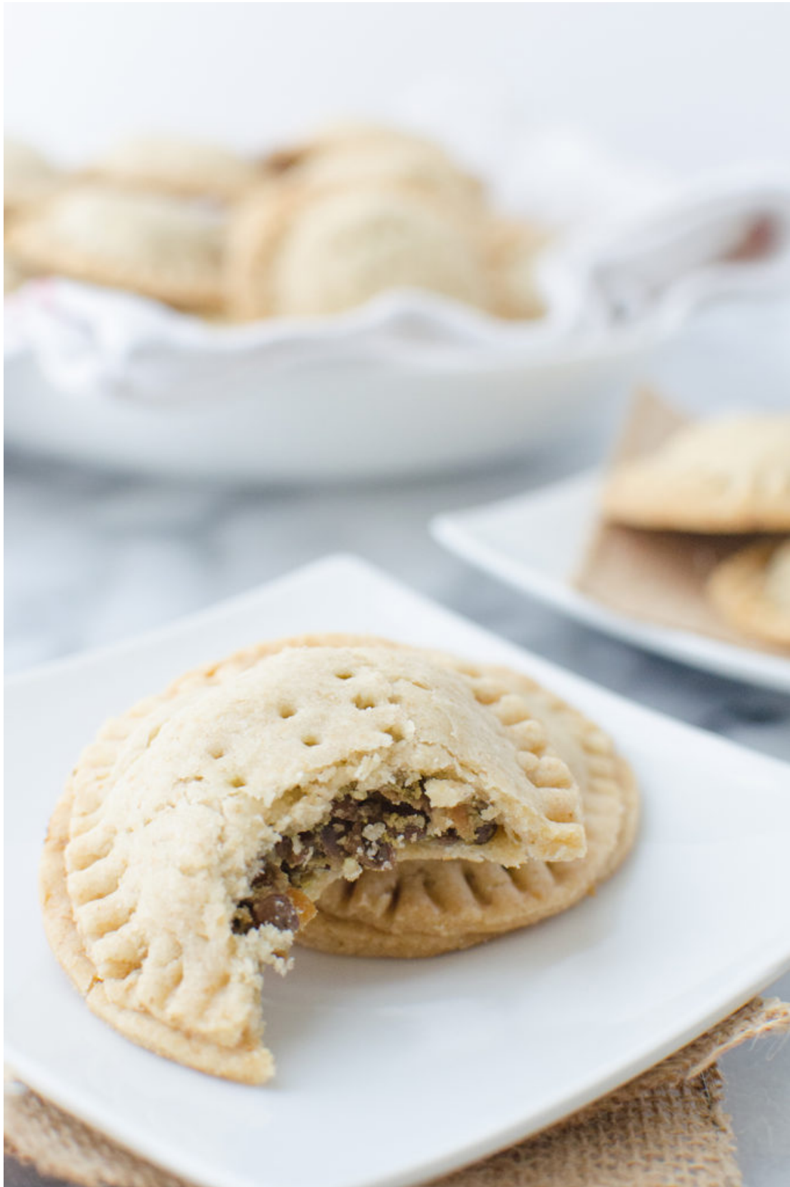
Lentil Hand Pies with Walnut Pesto from Delish Knowledge