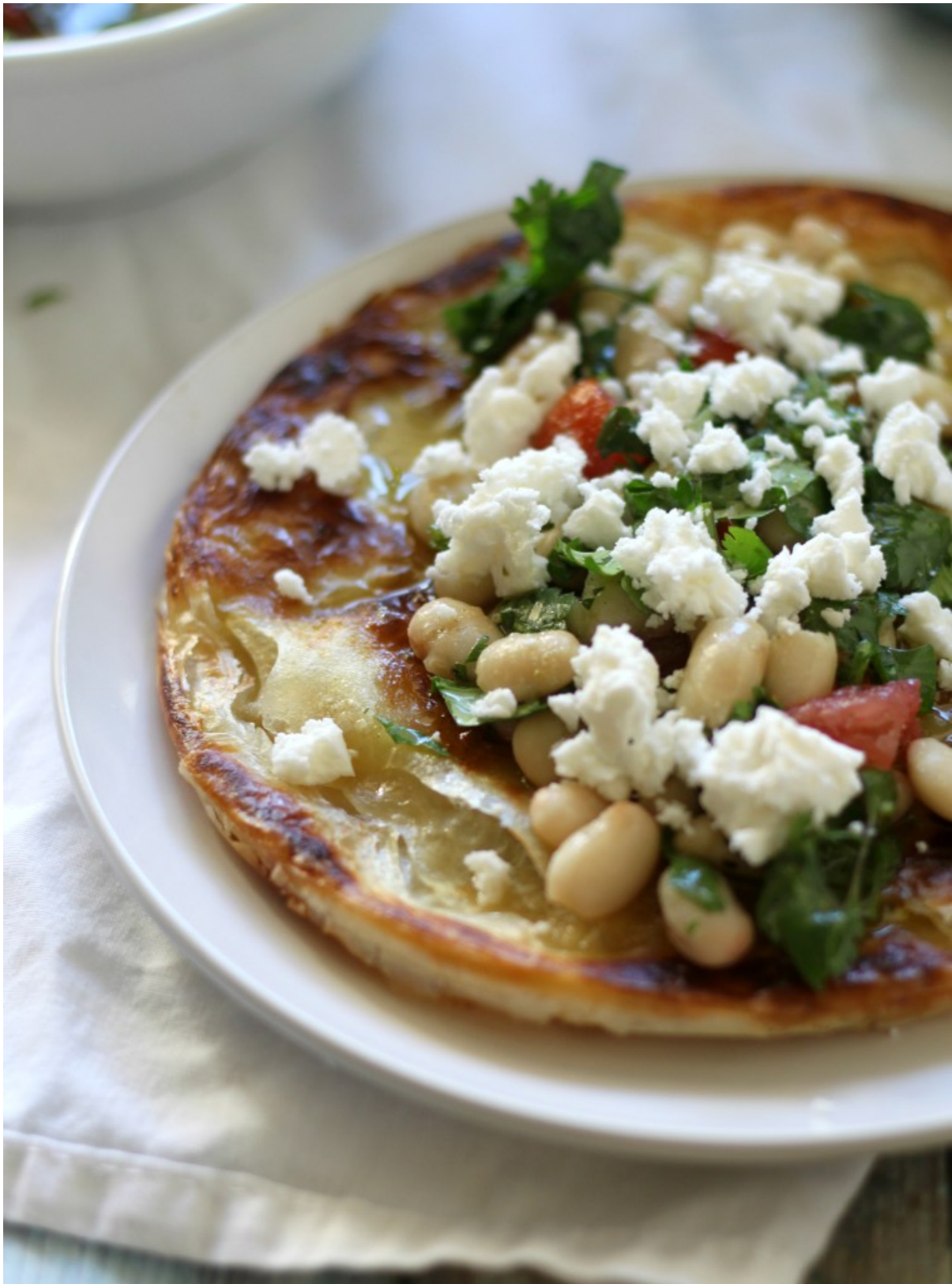
Za'atar White Bean Salad on Malawach