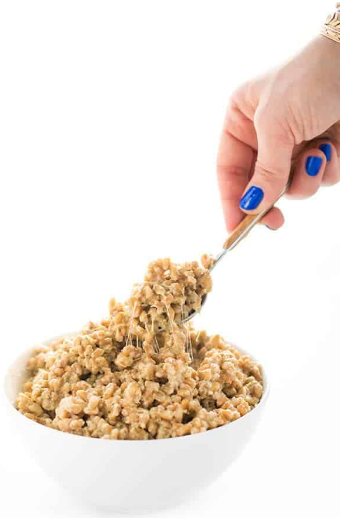
Cheesy Pesto Farro from The Lemon Bowl