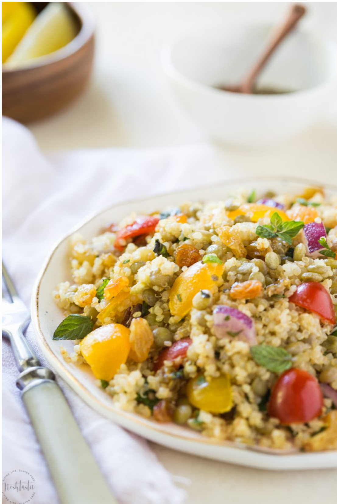
Lentil Quinoa Salad with Golden Raisins and Lemon Dressing from Noshtastic