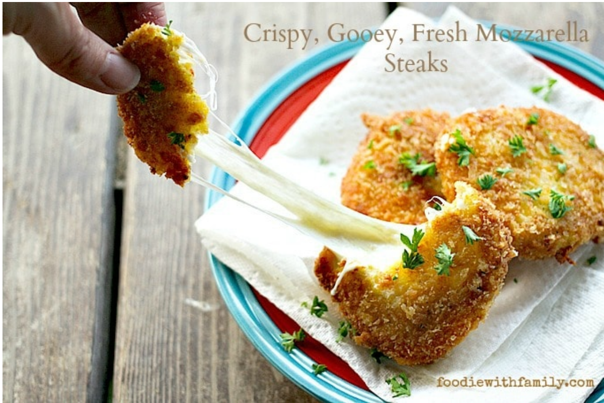
Crispy, Goopy Fresh Mozzarella Steaks from Foodie with Family