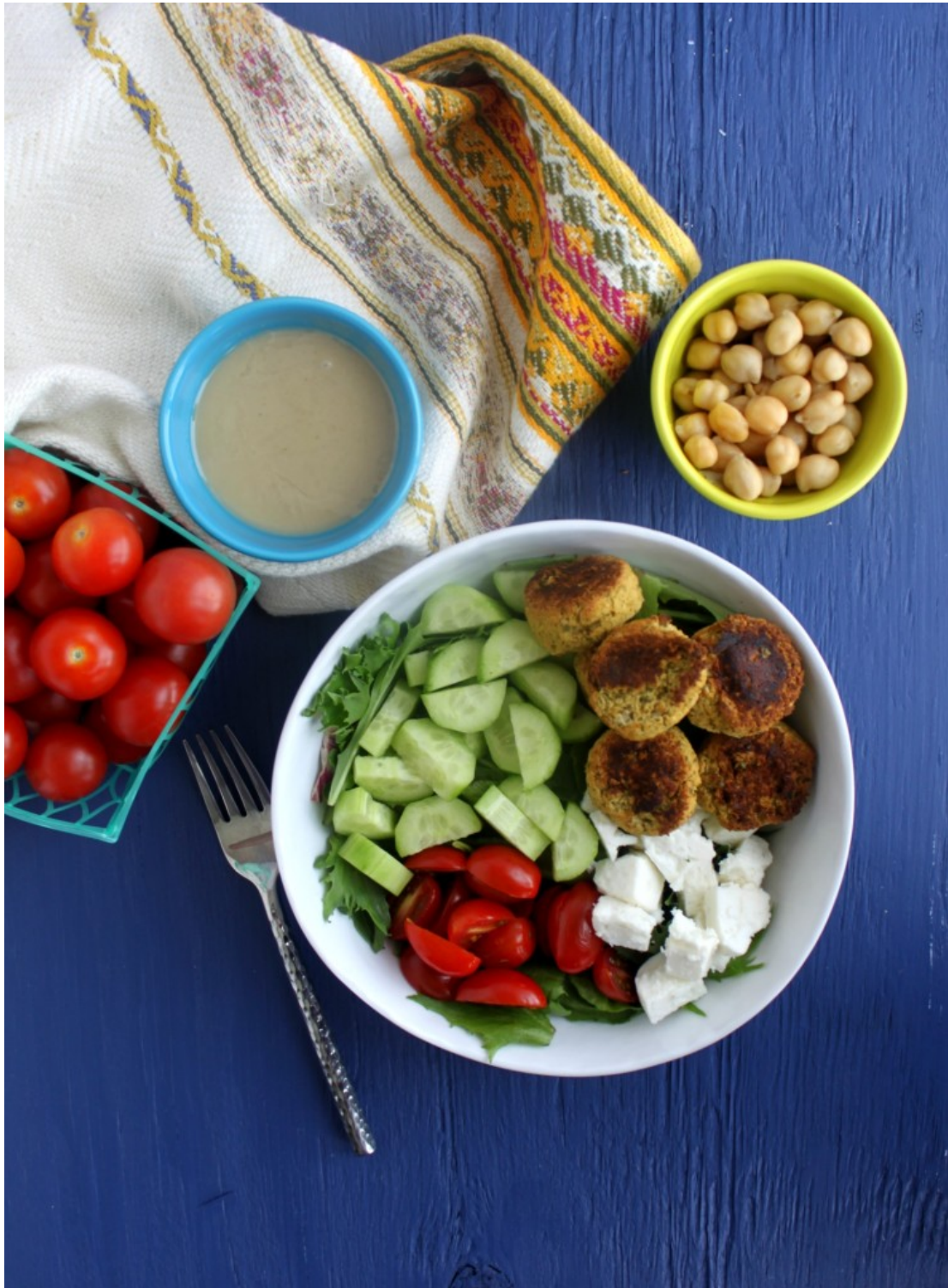
Falafel Feta Salad from Jewhungry