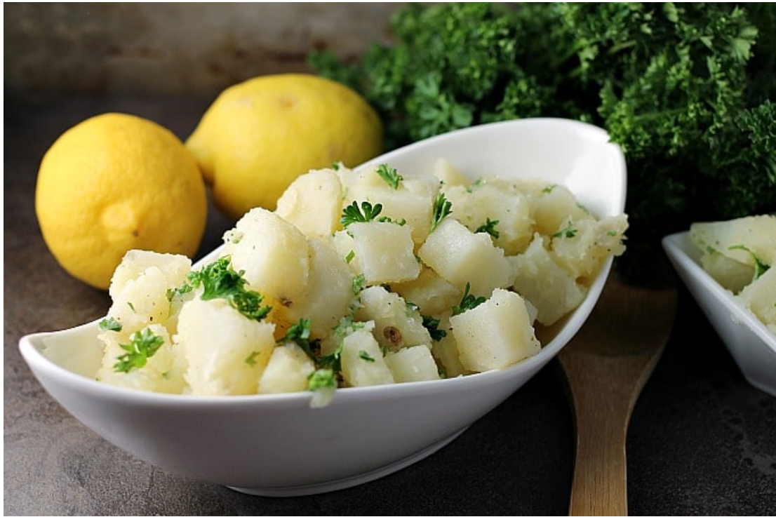
Arabic Potato Salad from Persnickety Plates