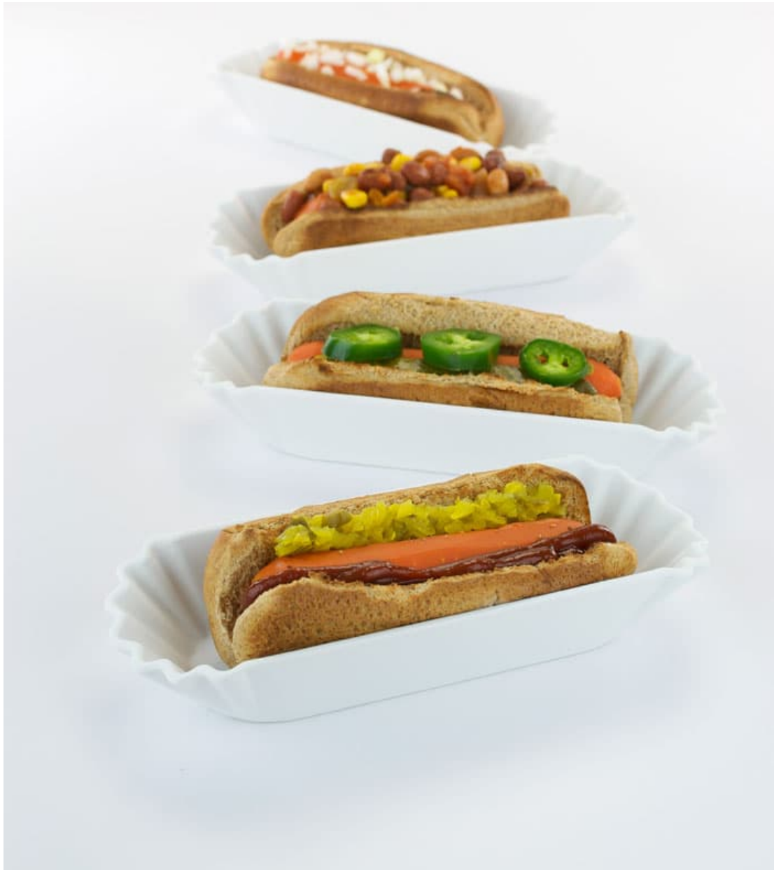
All-Natural Carrot Dogs from Healthy Slow Cooking