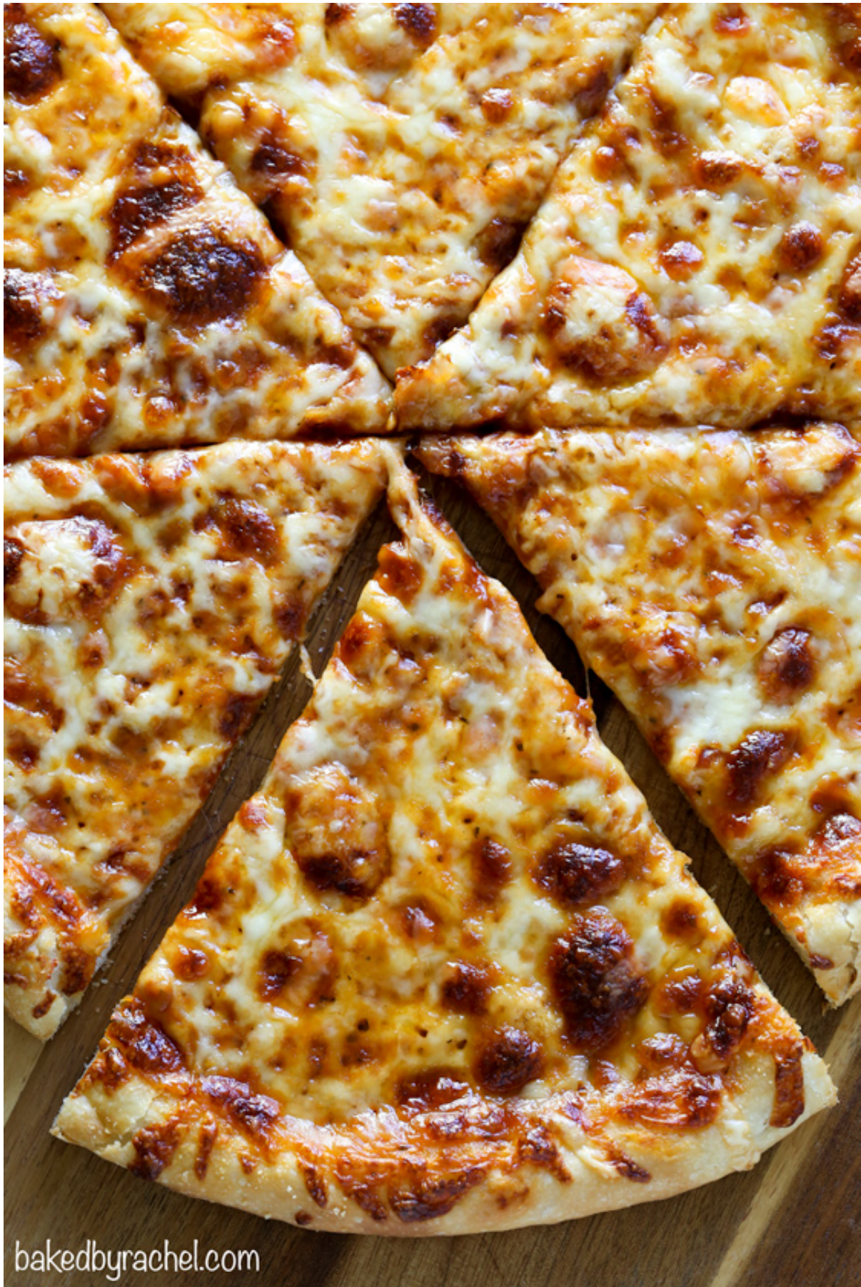
Classic Thin Crust Three Cheese Pizza from Baked by Rachel