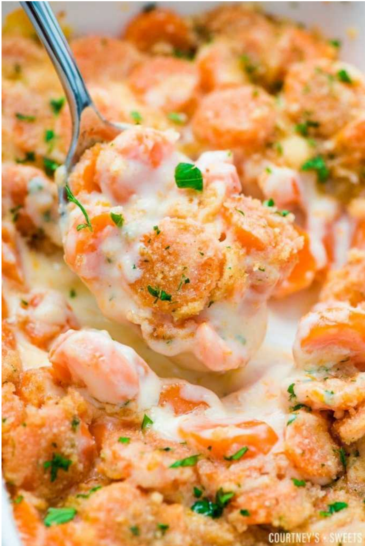
Cheesy Carrot Casserole with Bread Crumb Topping from Courtney's Sweets