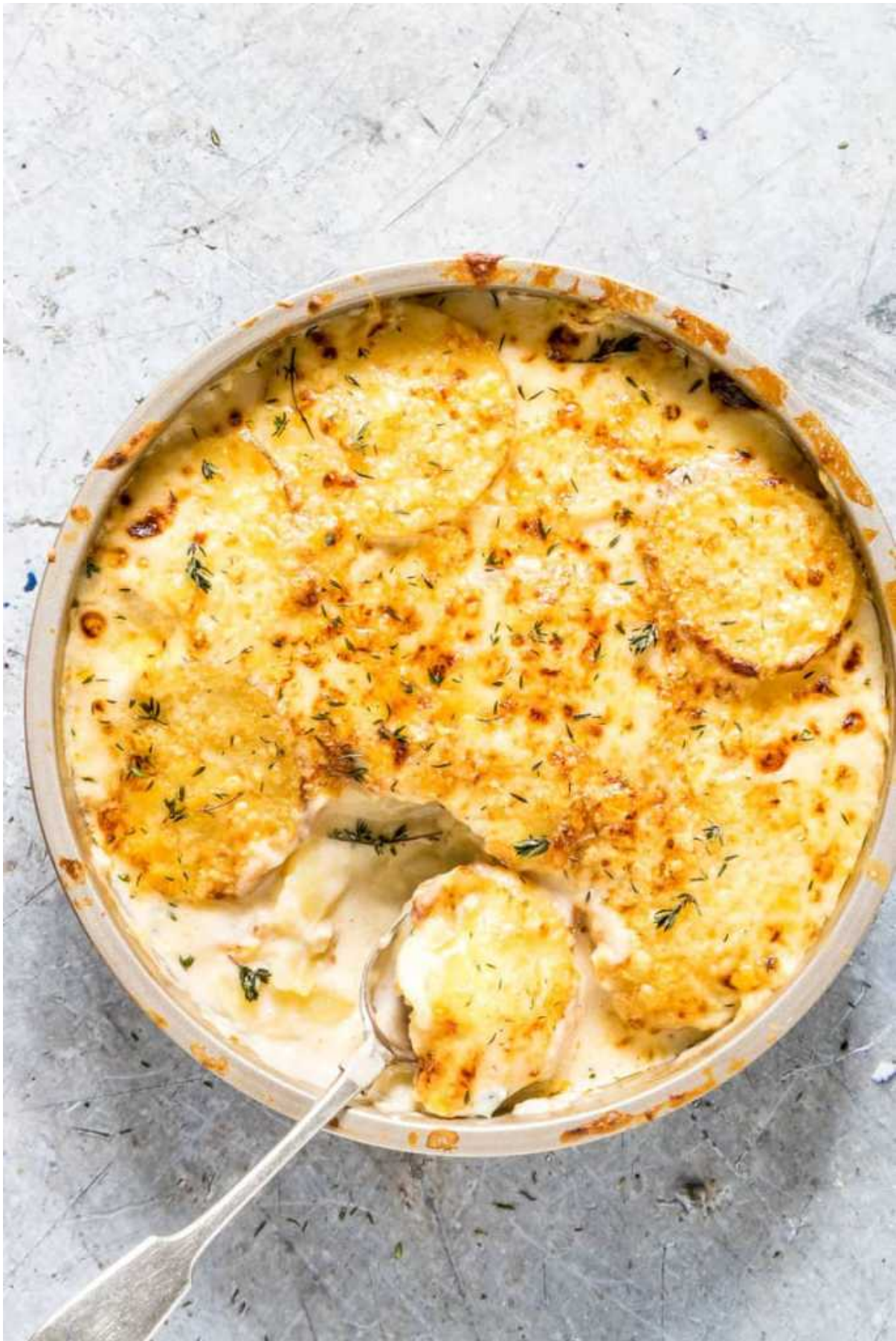
Easy Scalloped Potatoes from Recipes from a Pantry