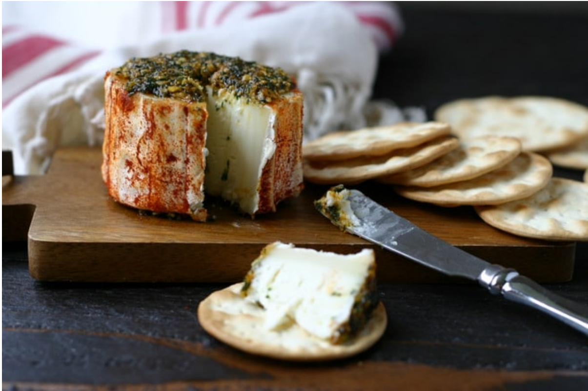
Marinated Cana de Cabra (Spanish Goat Cheese) from Everyday Maven