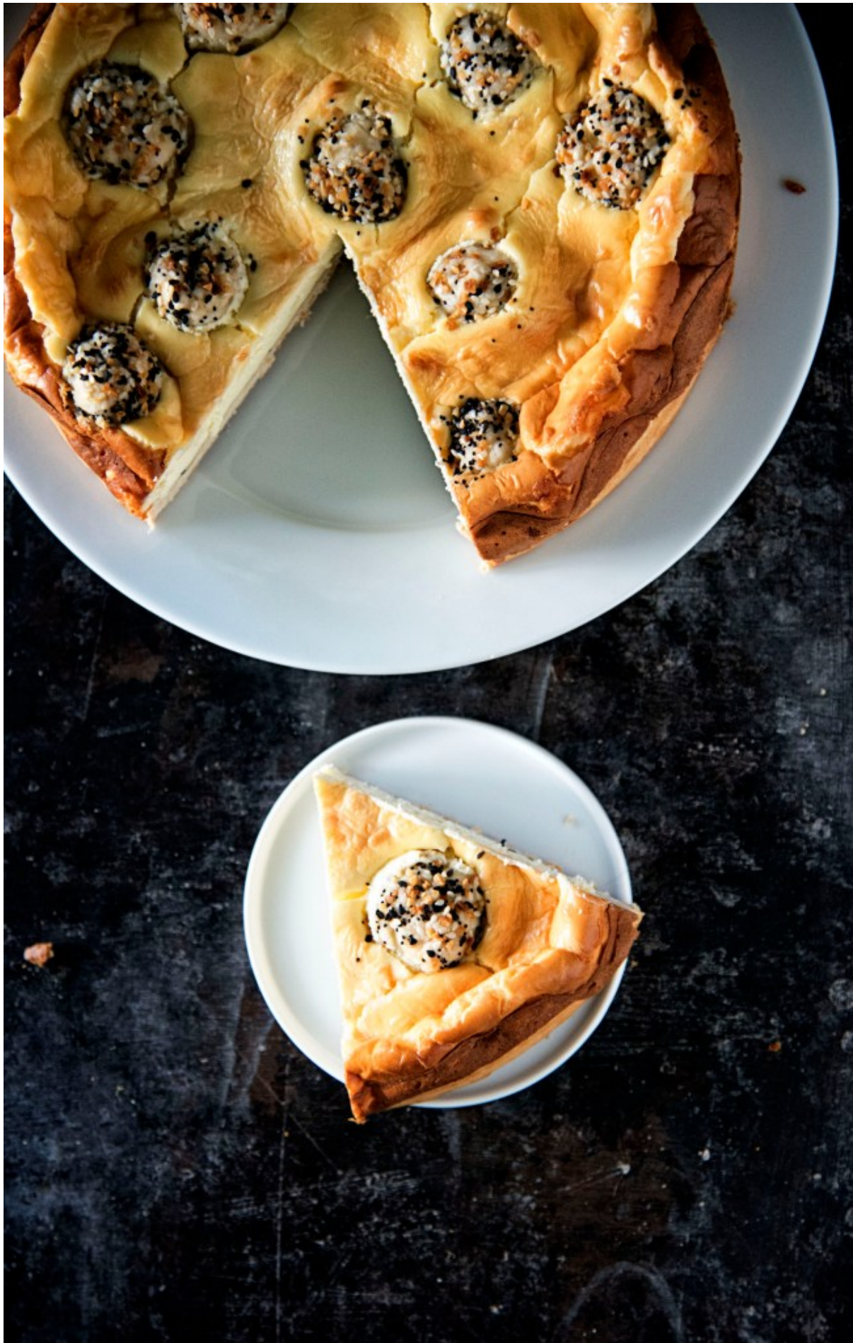
Everything Bagel Cheesecake from Sweet Recipea