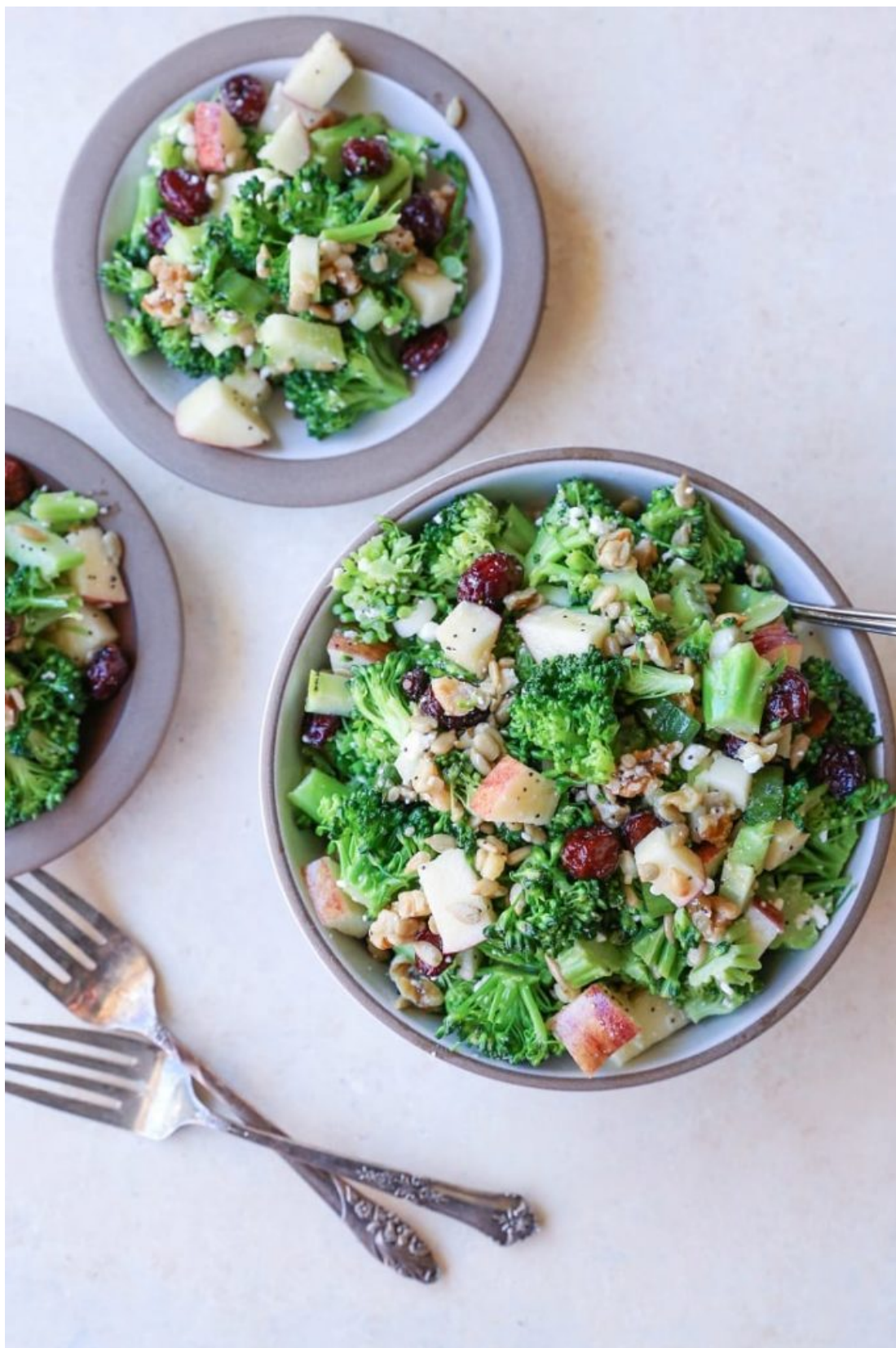
Broccoli Salad with Lemon Poppy Seed Dressing from The Roasted Root