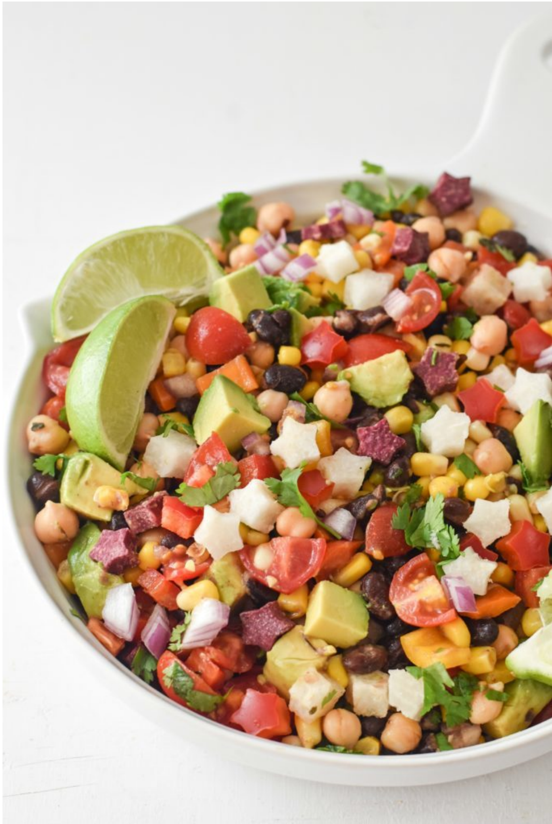
California Cowboy Caviar from Fork and Beans