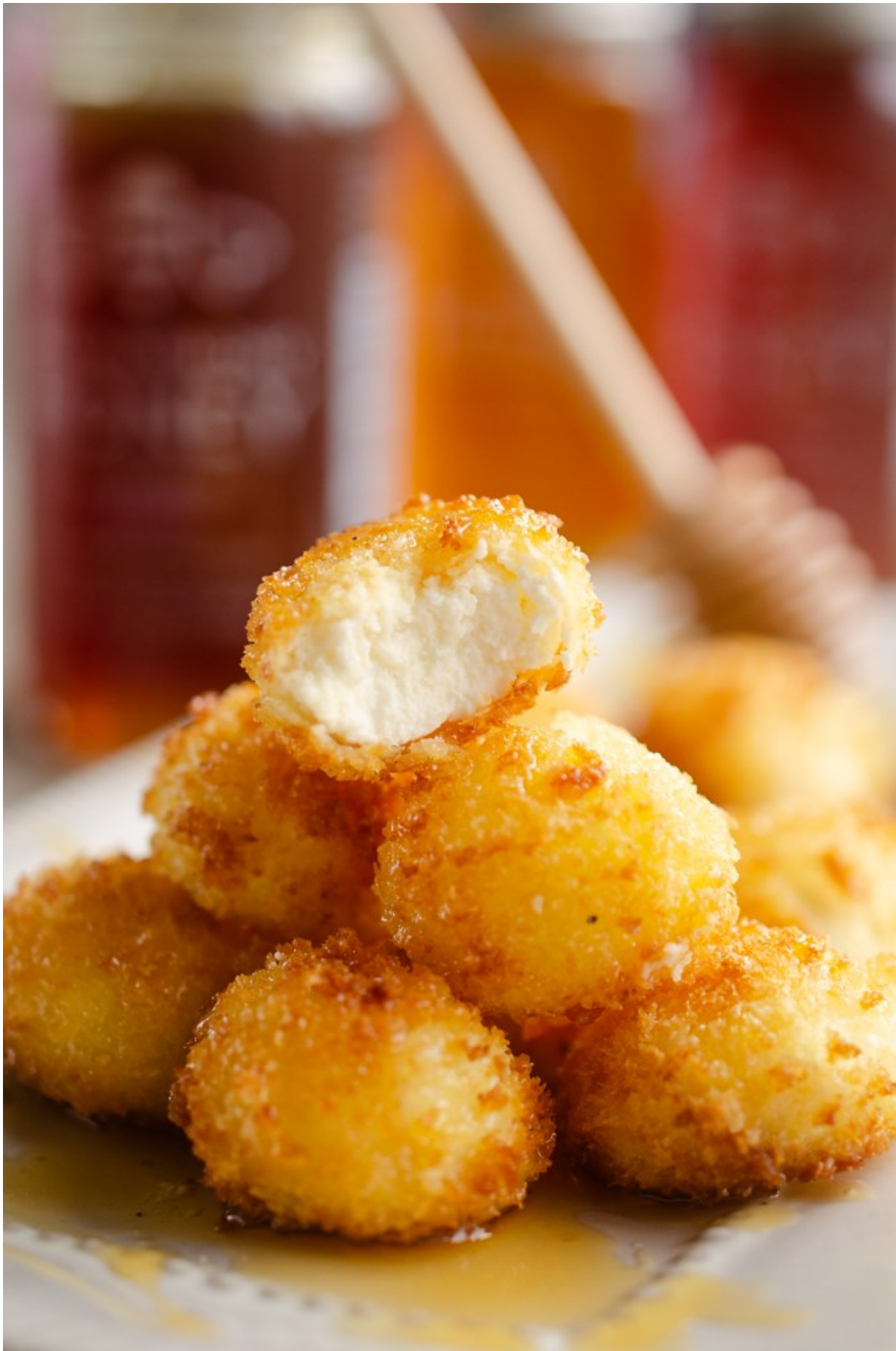
Airfryer Honey Goat Cheese Balls from The Creative Bite