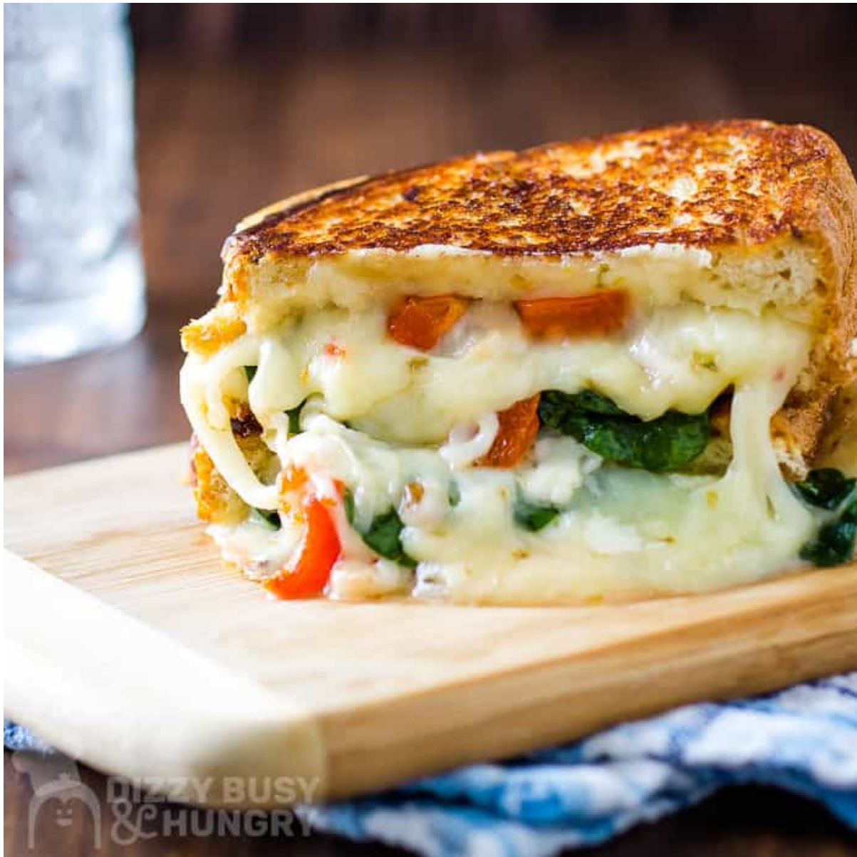
Roasted Red Pepper Oven-Grilled Cheese from Dizzy, Busy, and Hungry