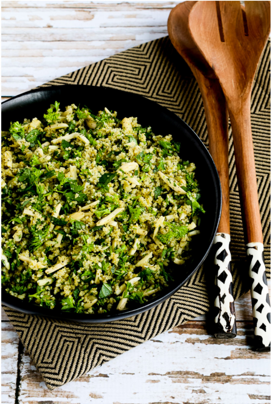
Kalyn's Tabbouleh with Almonds from Kalyn's Kitchen