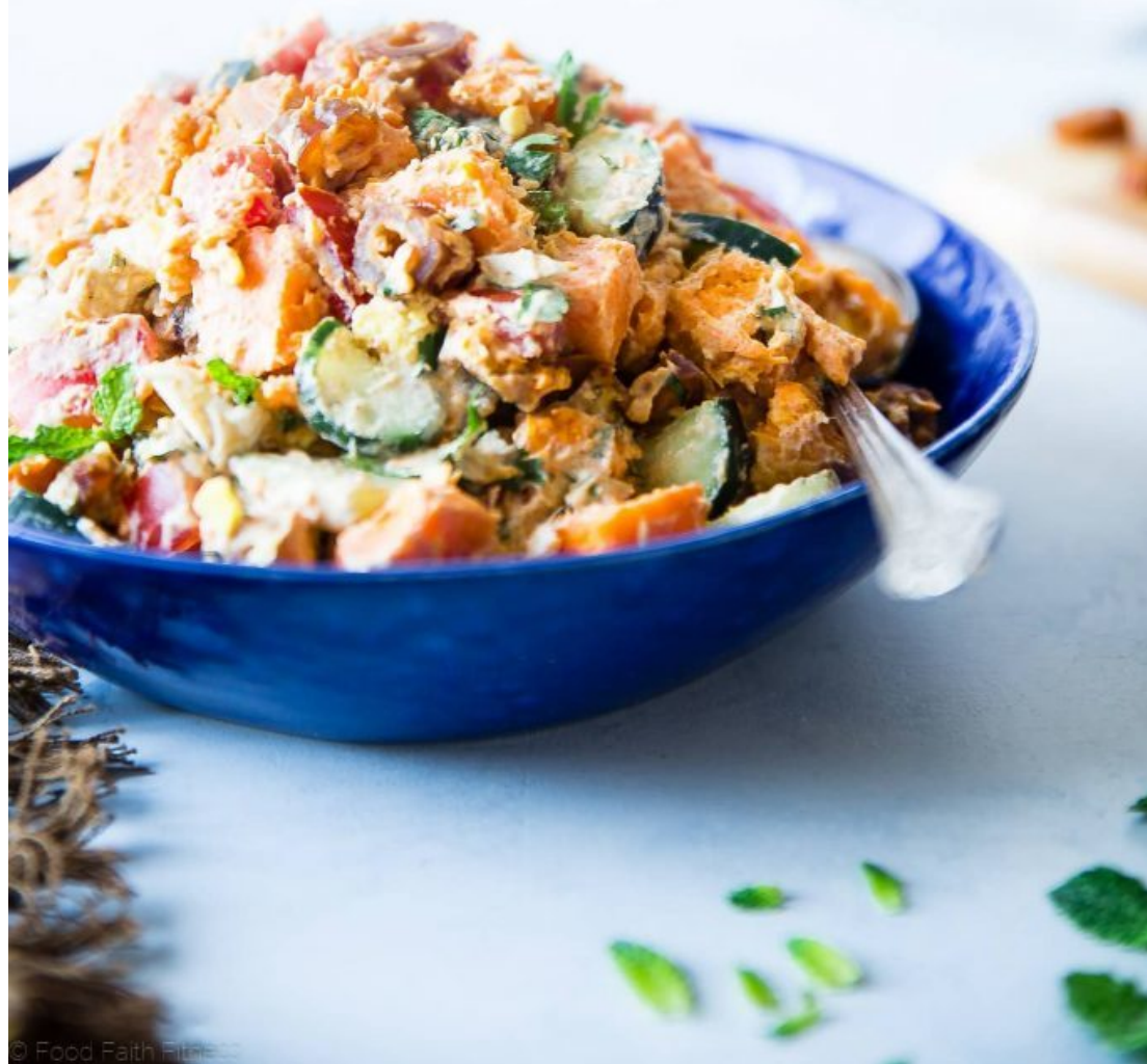
Moroccan Sweet Potato Salad from Food Faith Fitness