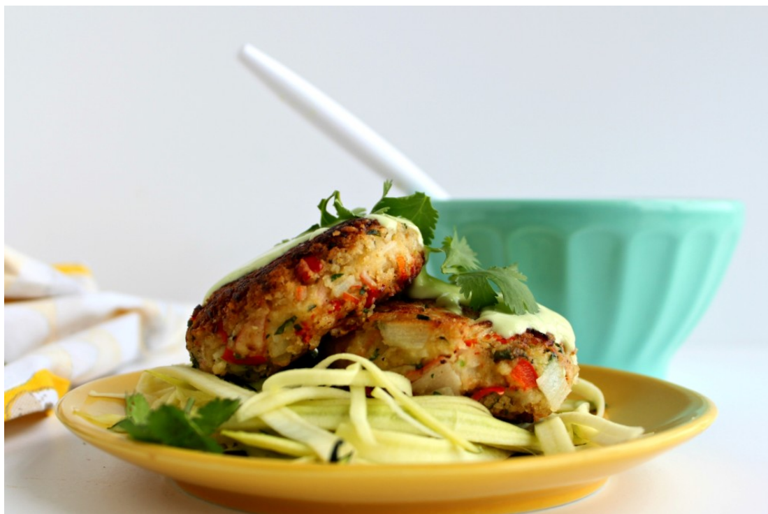
Kosher 'Krab' Cakes with Zoodles and Avocado Crema from Jewhungry