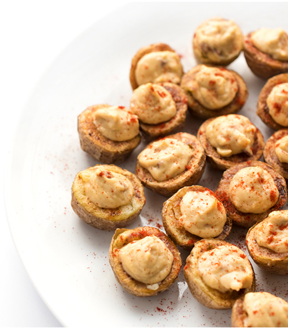
Chipotle Hummus-Stuffed Potato Bites from The Lemon Bowl