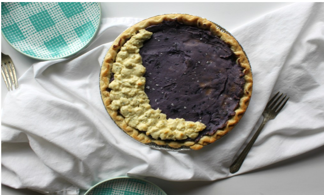
Savory Mashed Purple Potato Pie with Garlic Cream Cheese from Jewhungry the Blog