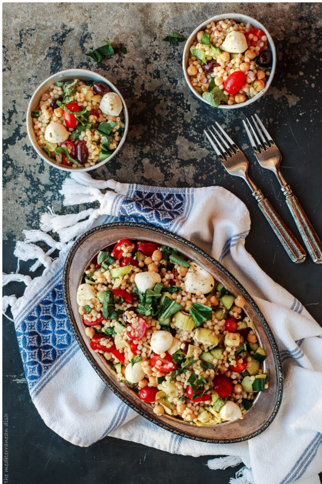
Israeli Couscous Recipe with Chopped Veggies, Chickpeas, and Artichoke from The Mediterranean Dish