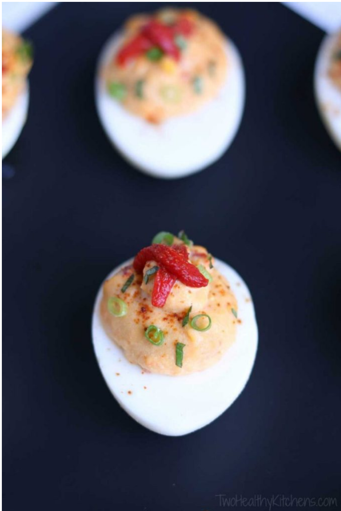
Mediterranean Deviled Egg Recipe with Roasted Red Pepper and Hummus from Two Healthy Kitchens