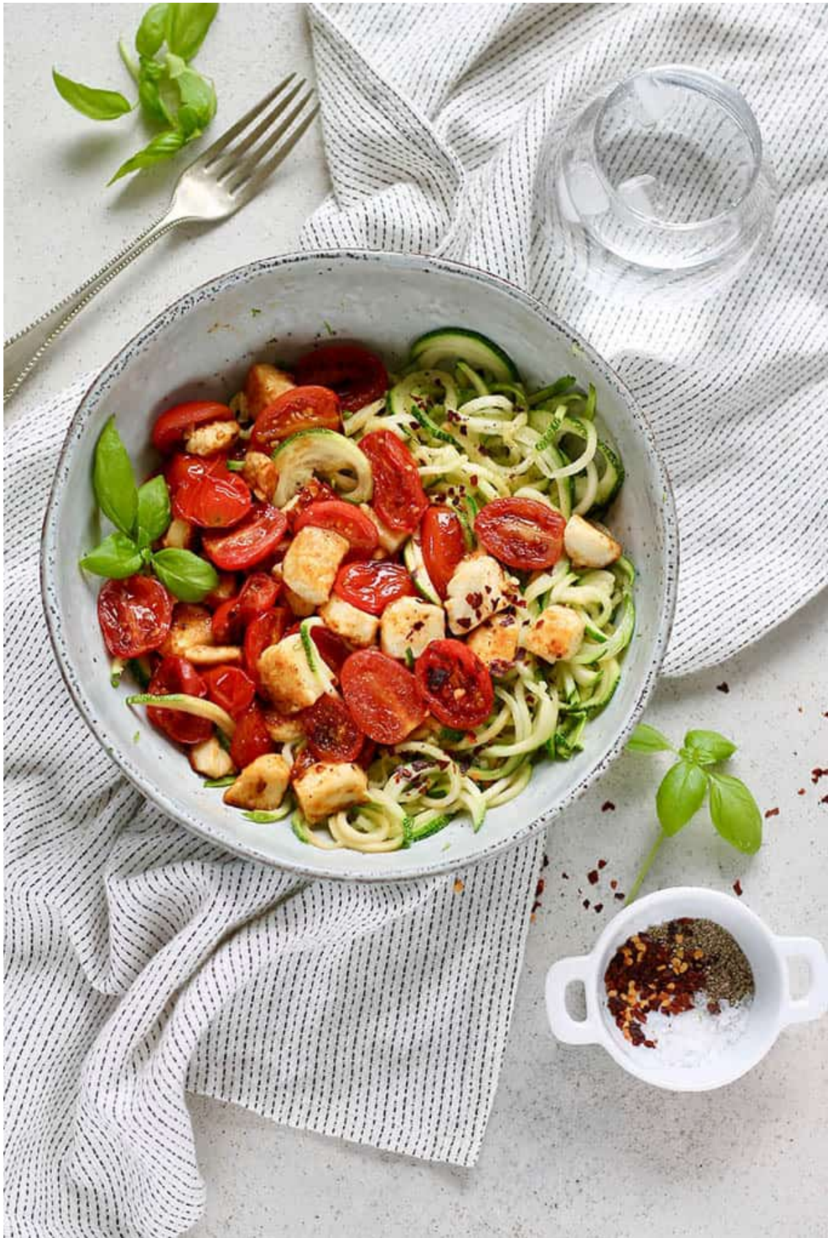
WARM ZUCCHINI NOODLE SALAD WITH TOMATOES AND HALLOUMI from Hey, Nutrition Lady