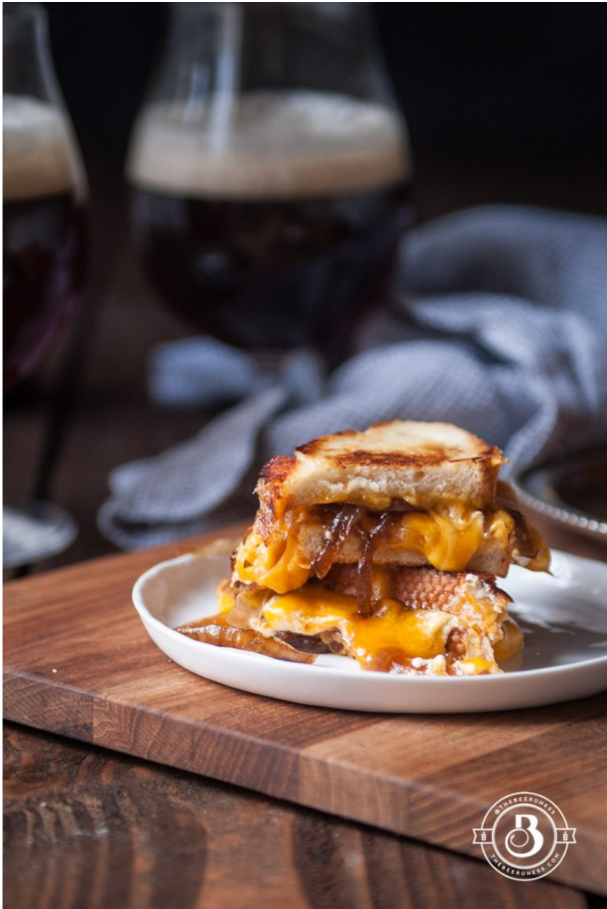
Slow Cooker Beer Caramelized Onion Grilled Cheese Sandwiches by The Beeroness