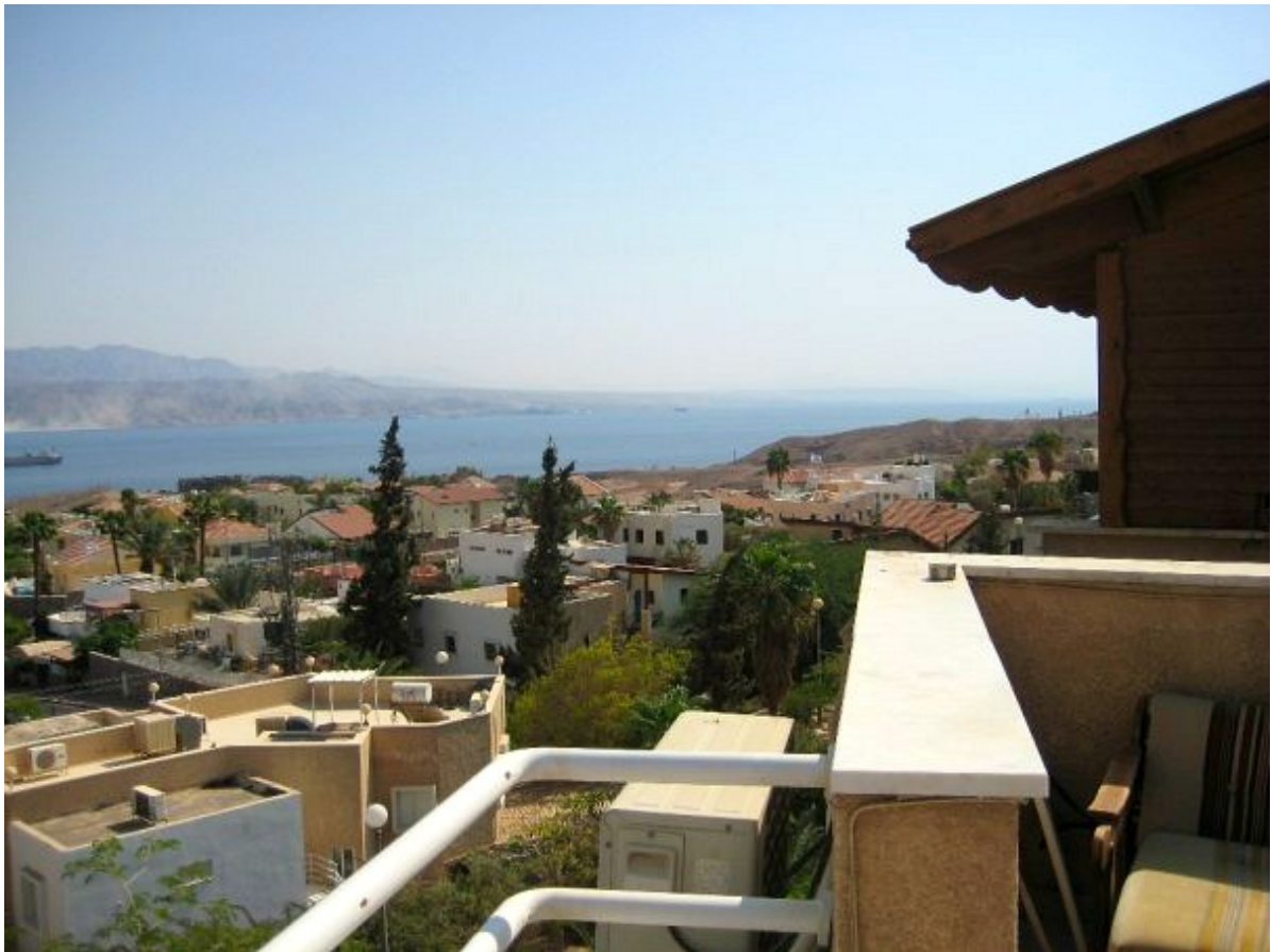
The view of Jordan from the husband's patio (mirpeset) in Eilat