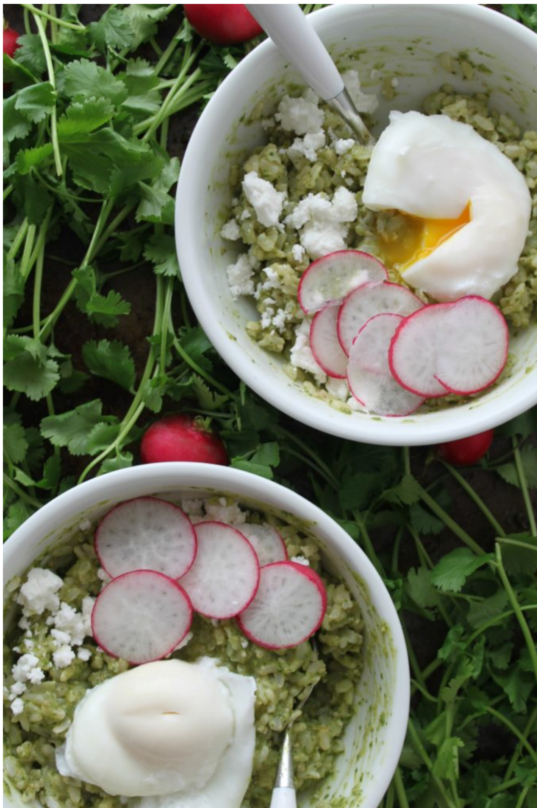
Brown Rice Pesto Breakfast Bowl from Jewhungry