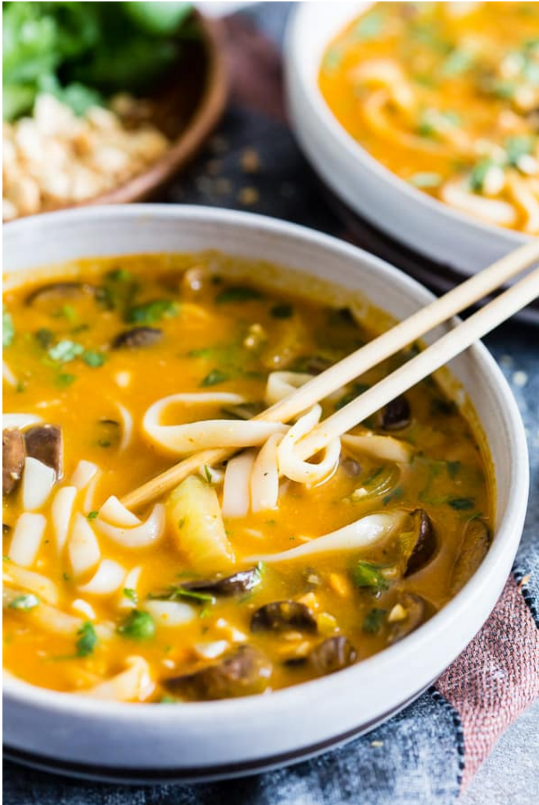
Vegan Red Curry Pumpkin Noodle Soup from Nutmeg Nanny