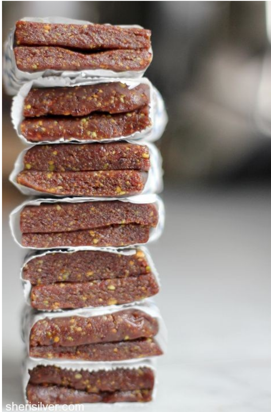
Three-Ingredient Energy Bars from Sheri Silver