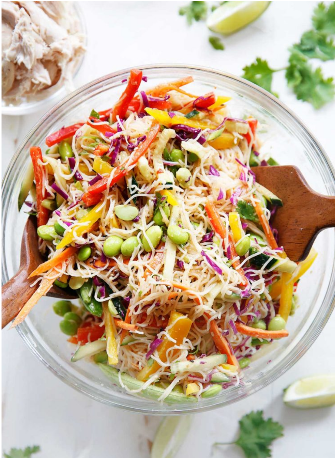
Cold Asian Noodle Salad from Lexi's Clean Kitchen