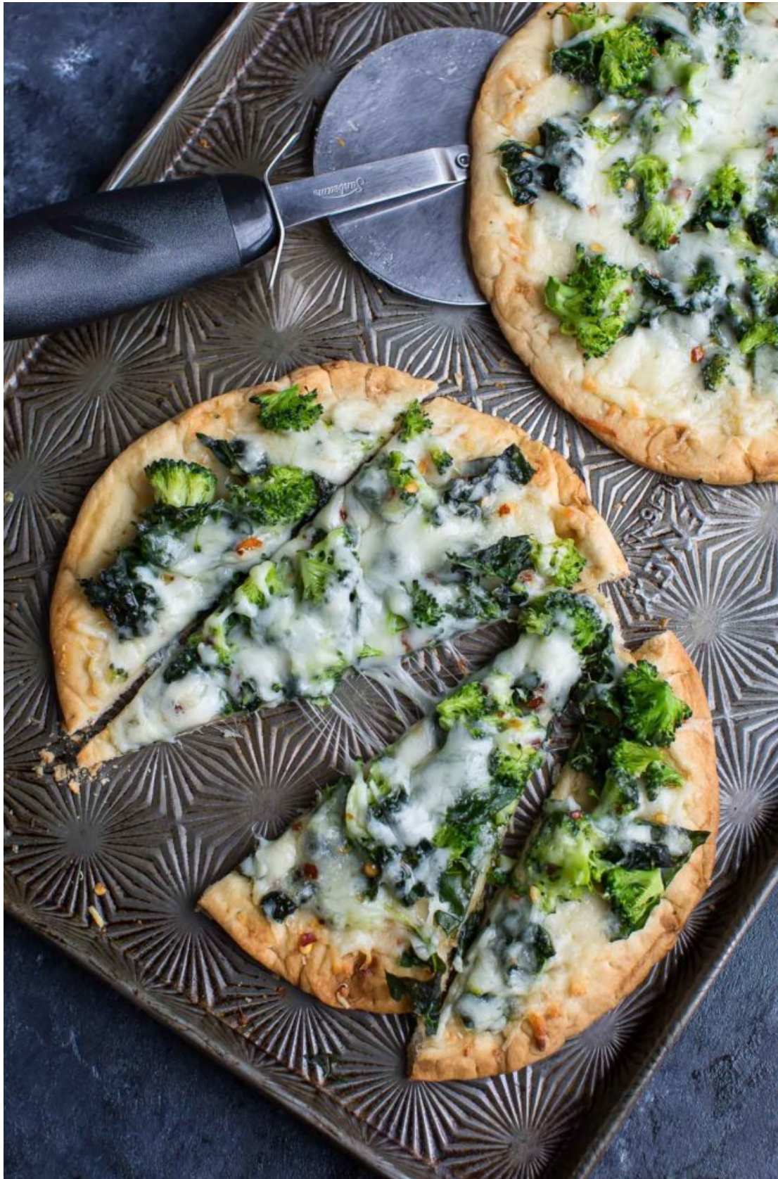
Cheesy Broccoli Kale Pesto Pizza from Peas and Crayons