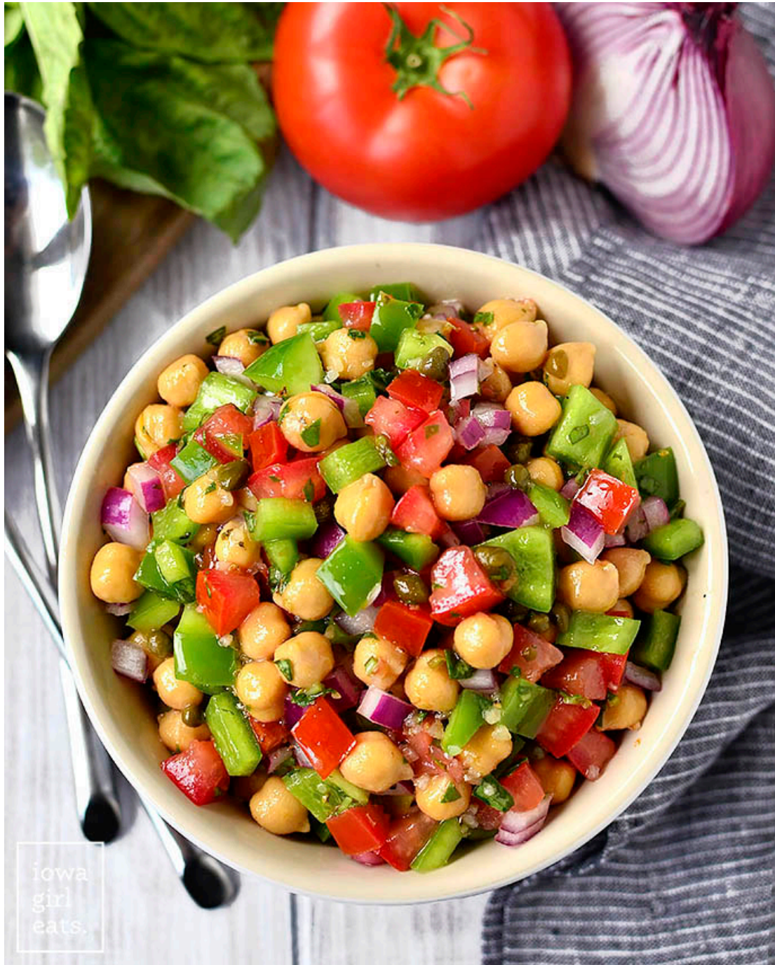
Italian Chickpea Salad from Iowa Girl Eats