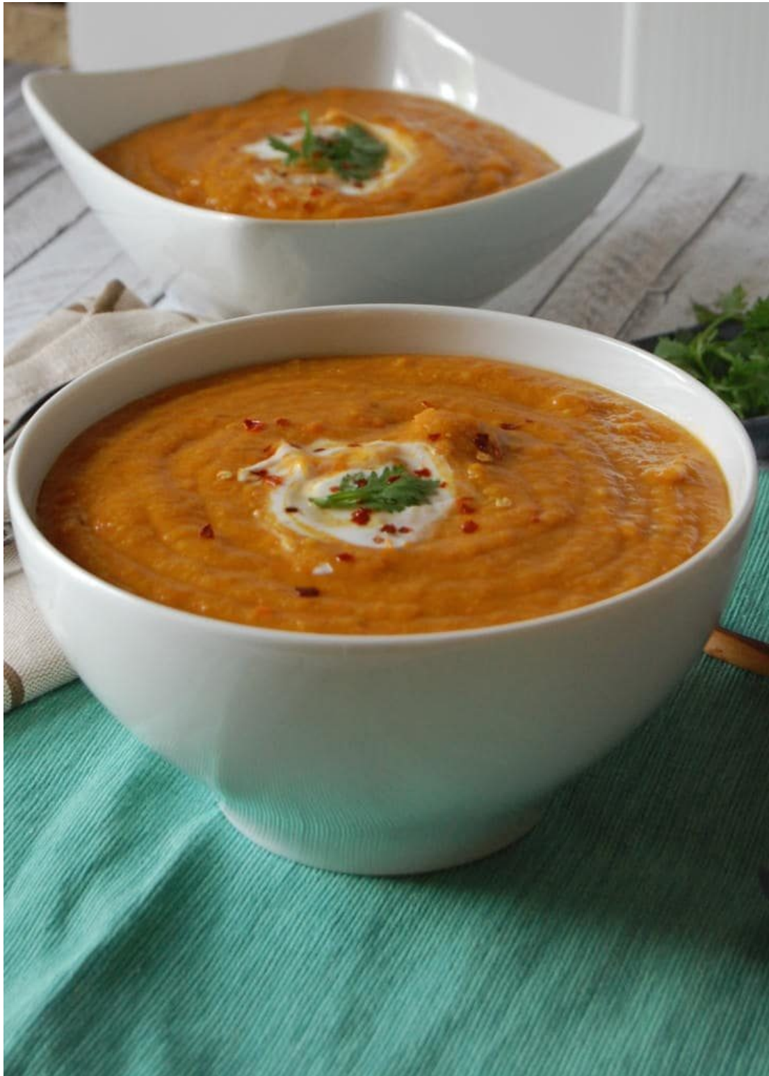
Moroccan Carrot Red Lentil Soup from A Cedar Spoon