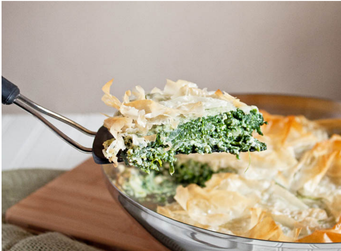
Skillet Spanakopita from Dessert for Two