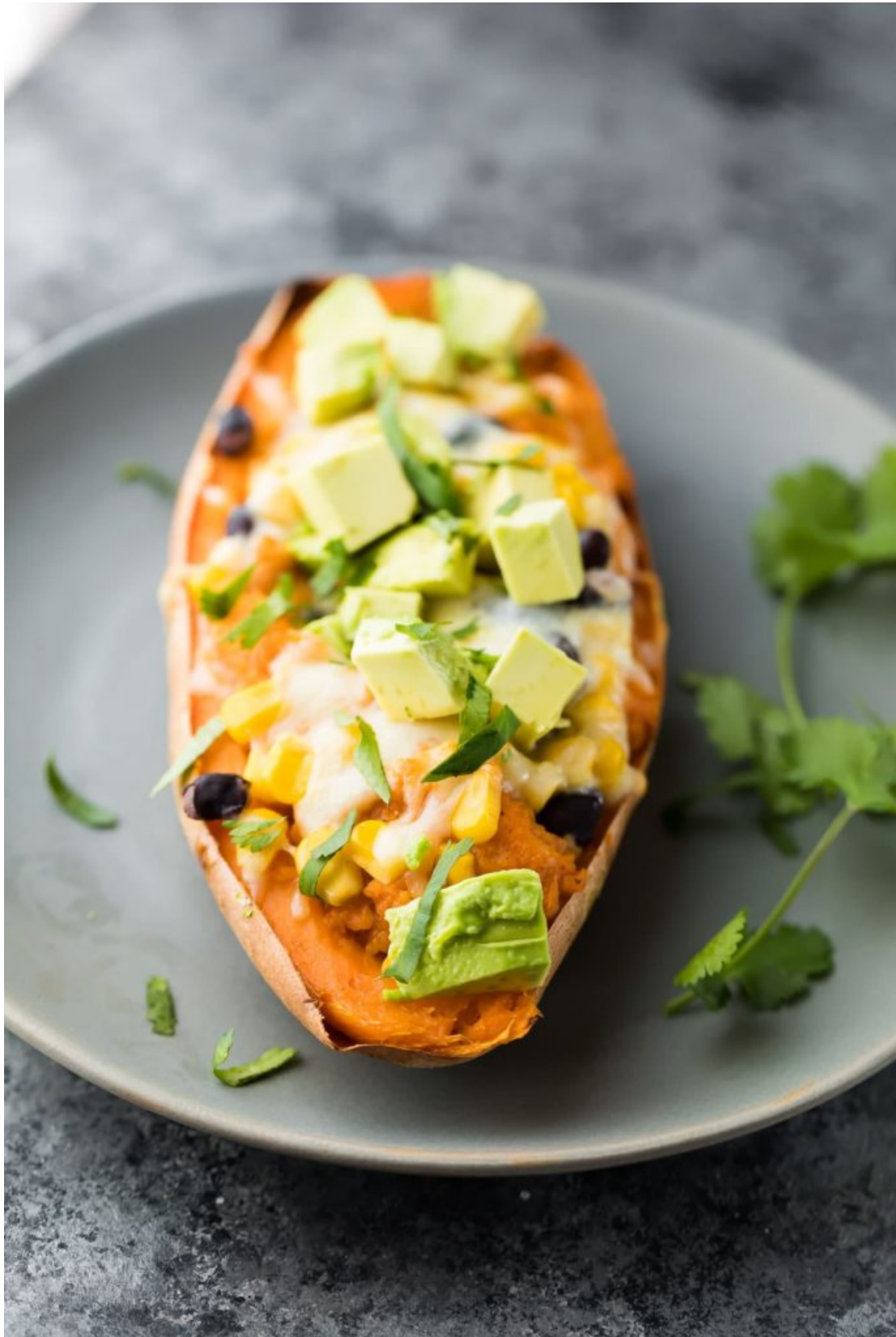
Freezer to Oven Stuffed Sweet Potatoes from Sweet Peas and Saffron