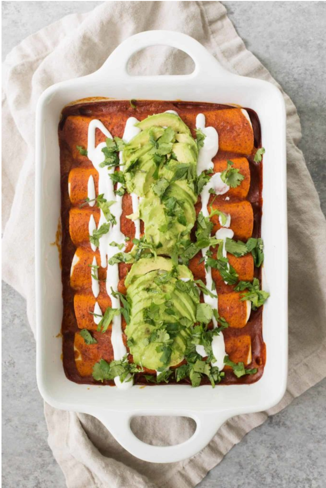
Veggie Fajita Enchiladas from Delish Knowledge