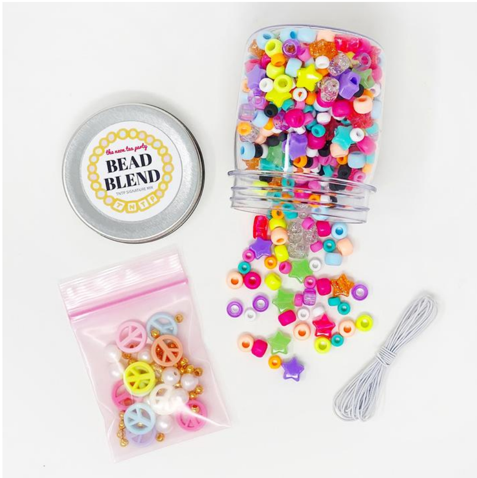
Custom bead blend from The Neon Tea Party.

And, not for nothing, but you can buy some of these artists' wears and you can also donate to support the Hillel that I oversee. I'm working hard to create a safe, inclusive Jewish space in Oxford, Ohio where Jewish college students can learn, grow, and become the future Jewish leaders we need them to be. Donate here to help further this work. Thanks for reading and Happy Thanksgiving.