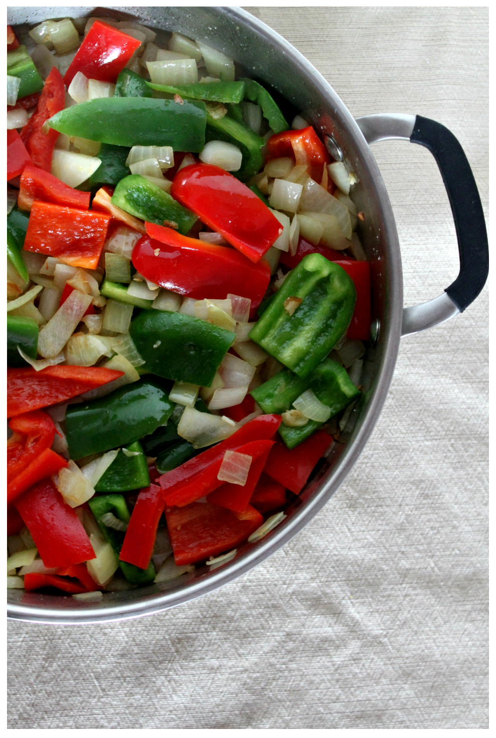
One might say this would be a perfect Christmas morning breakfast, might one?