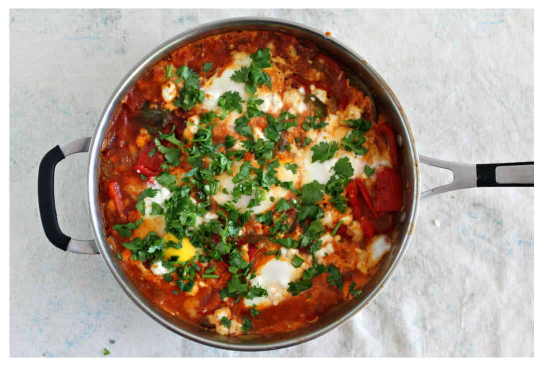
Pretty, pretty shakshuka

Cover your pan and allow to cook on a simmer for an addition 10 - 15 minutes. Keep an on the eggs to make sure that the yolks remain 'over easy' to 'over medium'. Add the feta, if using, halfway through your last 10 - 15 minutes of cooking. Once done, garnish with cilantro. Enjoy with a big piece of crusty bread.