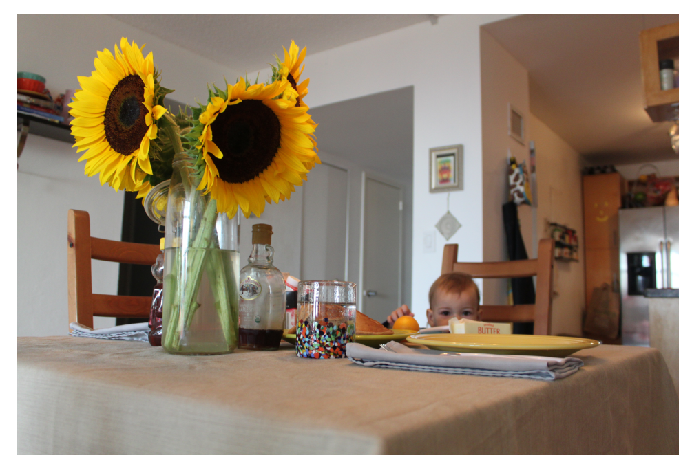
Not quite tall enough, but almost there.

Negev in Beer Sheva, Israel. I went over to a friend's place for lunch and there she was, cracking eggs directly into what I thought was spaghetti sauce but what I later realized was so much more. Shakshuka can be intimidating if you've never had it before but truly, it does not require a lot of skill in the kitchen (this is according to me, at least). It does require patience though as the tomatoes and the peppers need time to get all sugary and flavorful as they sit on a low heat.