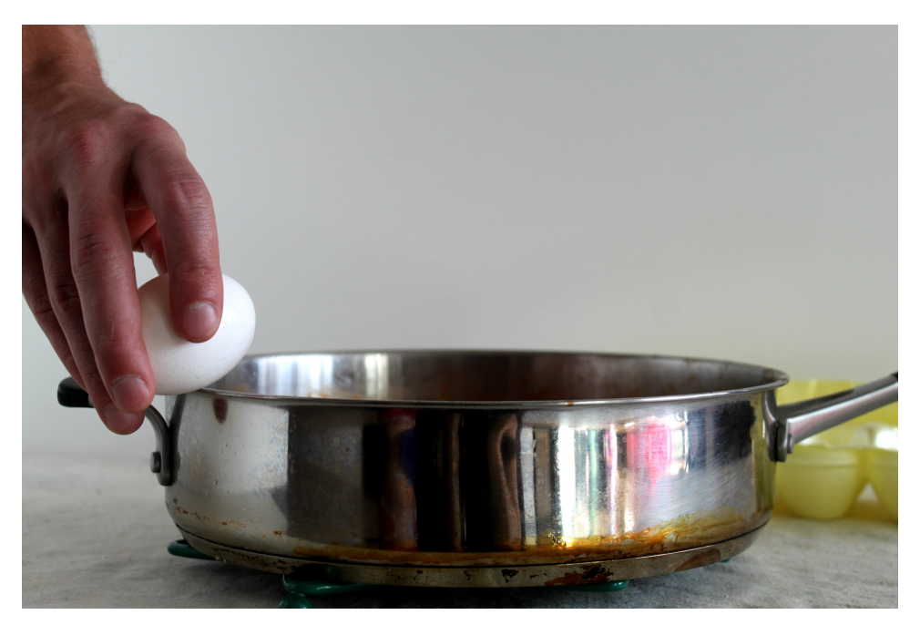
It's about to get egg-y in here.

The following is a completely unnecessary but completely awesome action shot of the first egg being dropped into the shakshuka. Make sure you dig a little hole out for the egg to nestle into before cracking. Mad props to my hubby, who is also my hand model, for indulging me in this one.