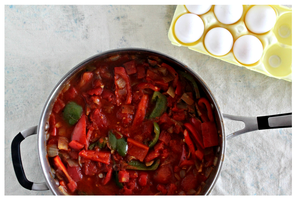
A perfect pair.