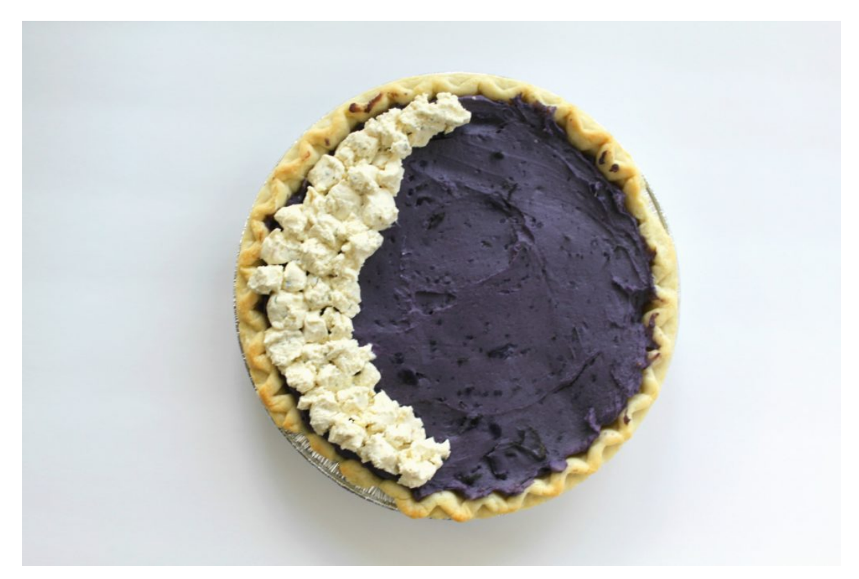
Before the bake.

the wars in Iraq and Afghanistan. I marched for fair wages in Chicago and for the equal rights of the LGBTQ community in Marietta, GA. But, truth be told, I'm scared. I'd love to take my oldest but I'm scared that something bad might happen and then what? Was I marching because I need her to have an experience or because I need to have an experience? I really don't know the answer to that question just yet.