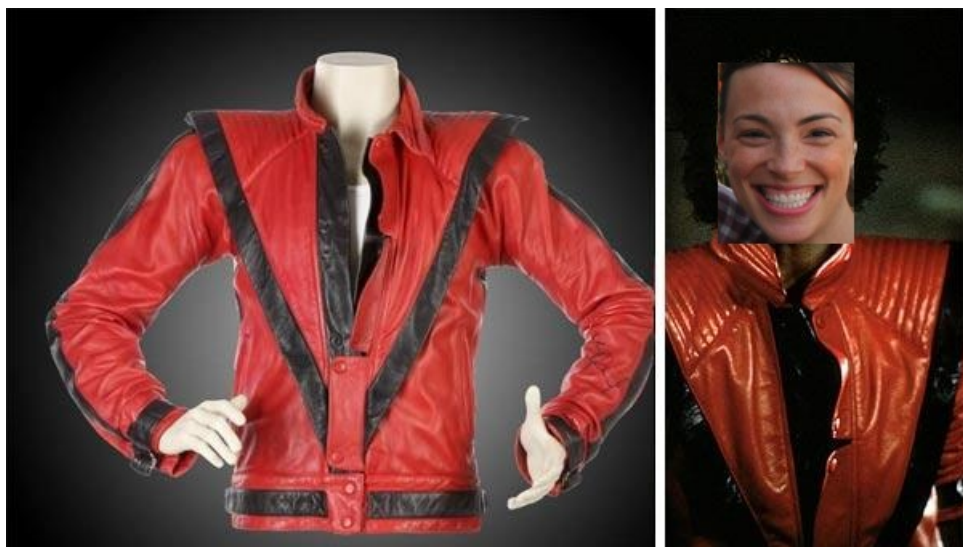
Just me and my red leather jacket circa 1983

really and truly hate. I'm not sure if it was the excessive use of red, black and white in 80s home decor (please don't even try to lie to yourself right now. You know you were a part of that 'situation'). Maybe it was the excess of red leather jackets, also occurring in the 80s, that rubbed me the wrong way? Maybe it was just the 80s in general and what they did to color? Who knows but what I can tell you is that immediately after our wedding I started L-O-V-I-N-G loving the color red. Someone got us a set of red Fiesta ware plates for our wedding and I couldn't stop using the mug. I was so drawn to the color. It just made me so happy so I figured, well, I am so happy in life so maybe red is the color of happiness? From there I started wearing red shoes and started the search for the perfect red lipstick (I am still, in fact, on that search) and my red obsession hasn't stopped.