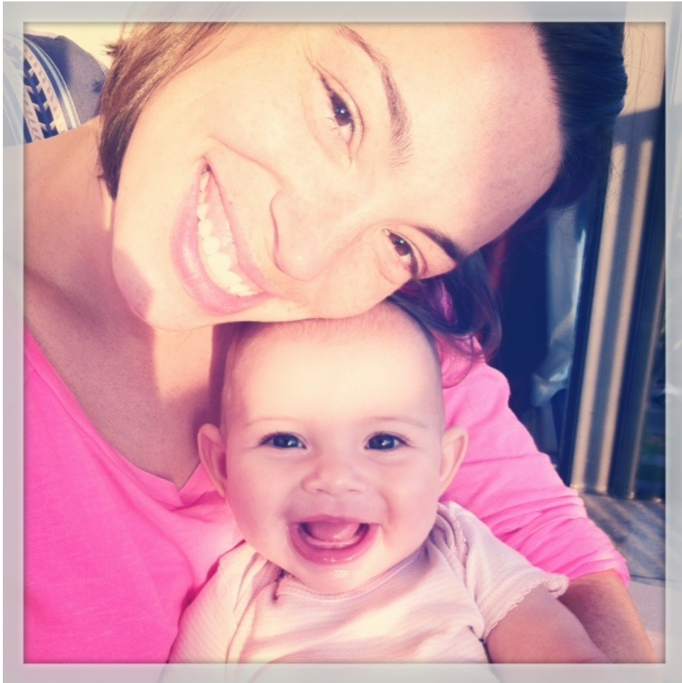
Embracing our pink

for Chanukah this year. Hmmm . . . I wonder if they have this in baby sizes?