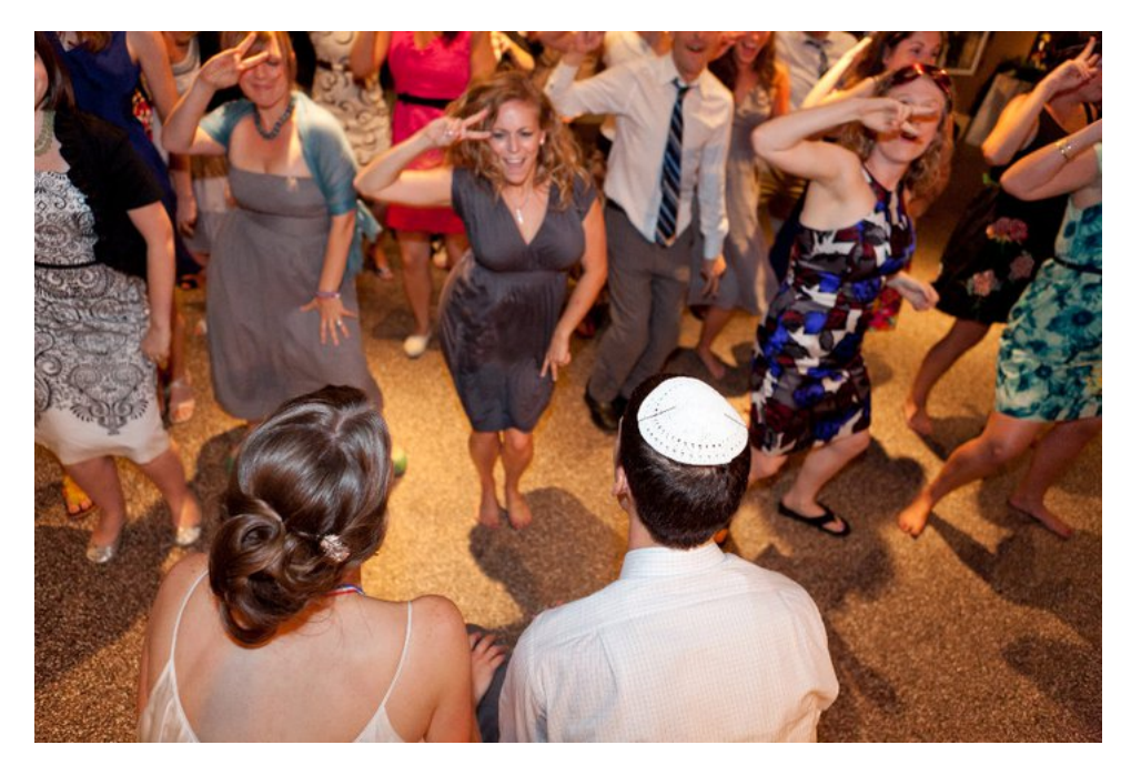
That's my awesome cousin, smack in the middle, leading a flash mob at my wedding.

After the show we went to his after-party and briefly caught up. He asked me if I was married yet to which I said, "no, quite the opposite. I'm single."