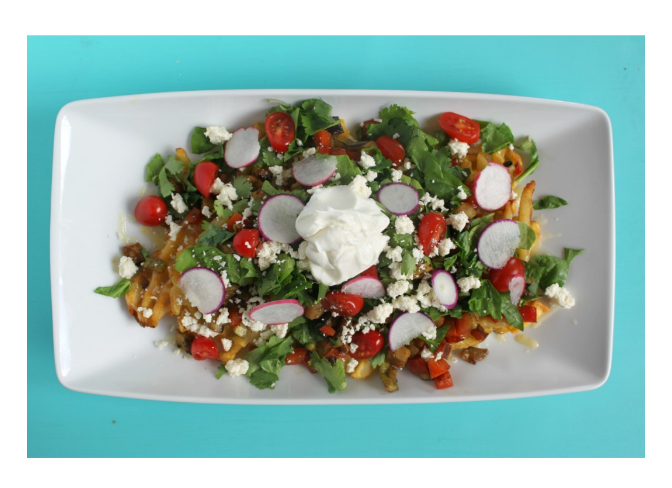
Loaded Veggie Cheese Fries