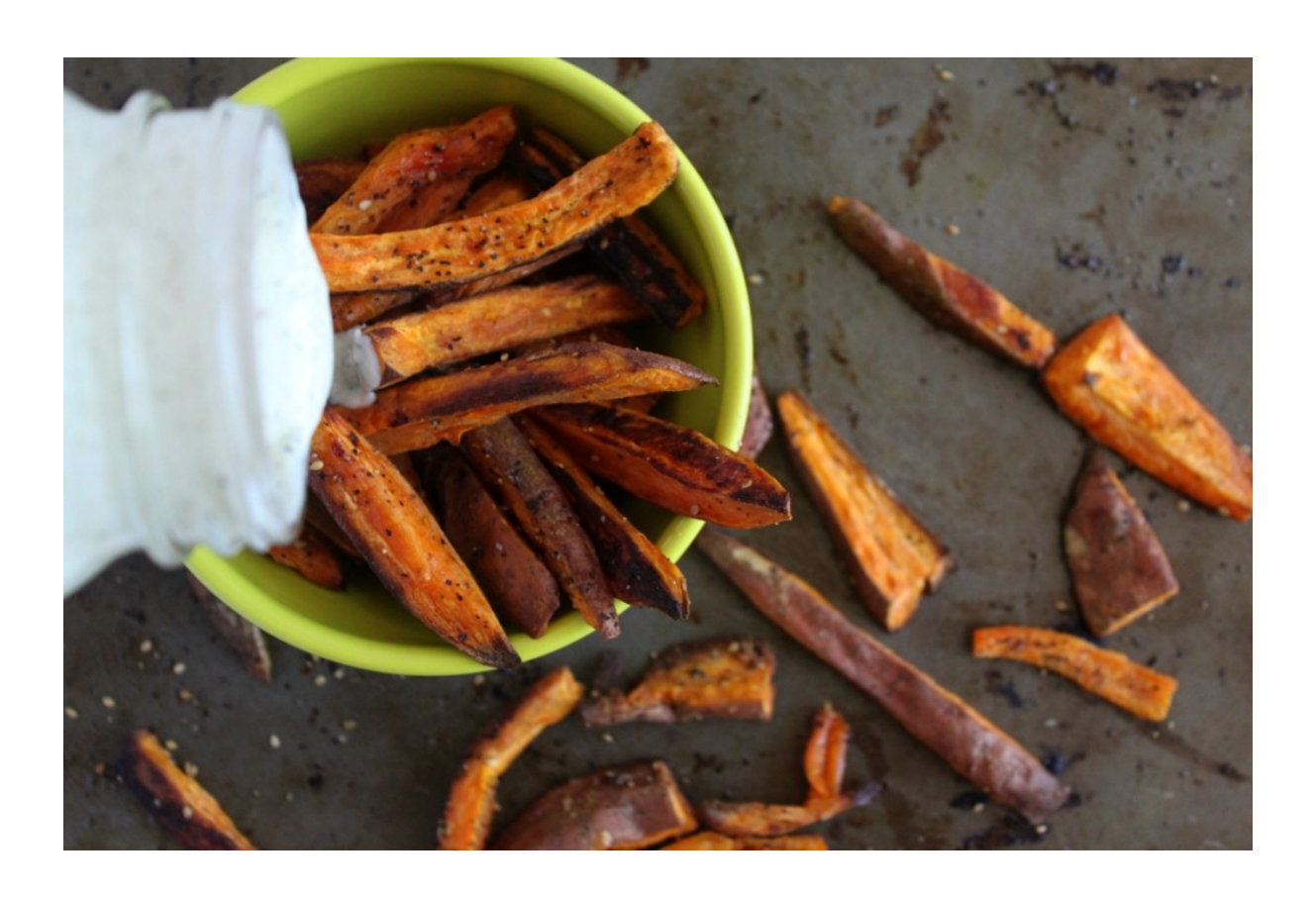
Sweet Potato Fries with Za'atar Ranch