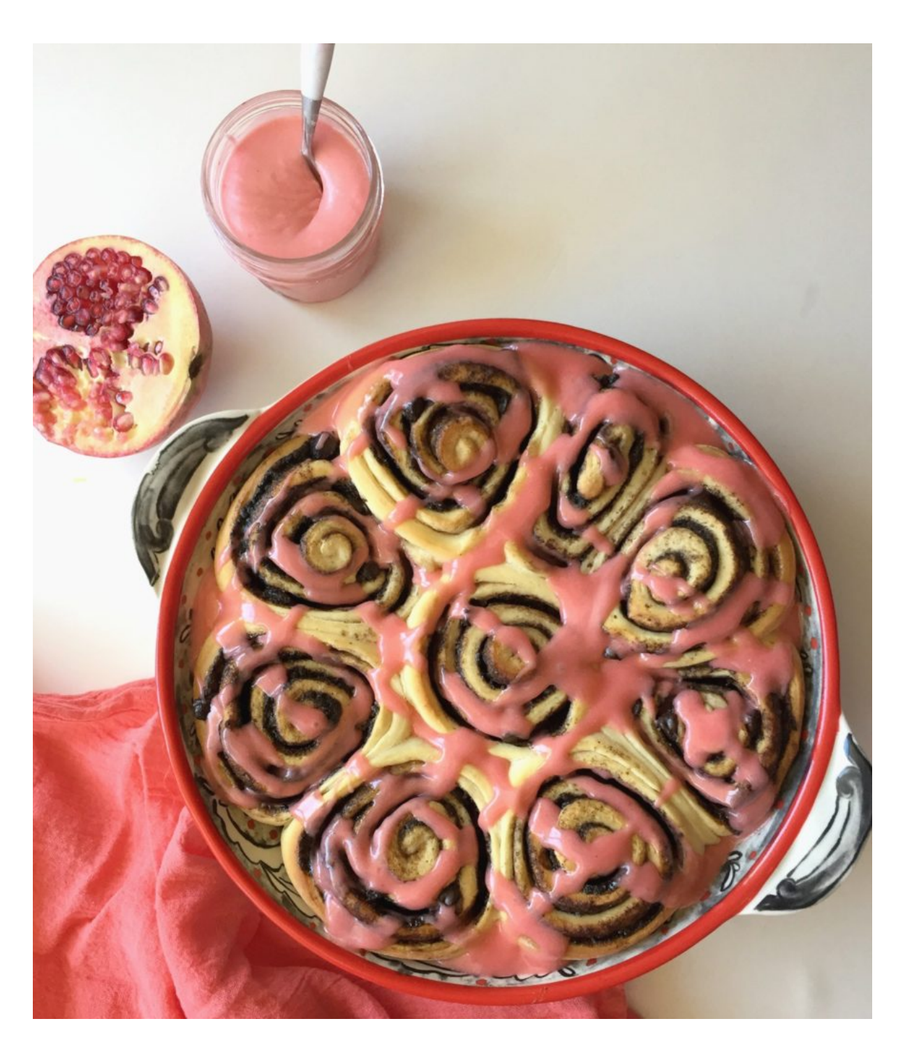
Chocolate Cinnamon Rolls with Pomegranate Icing