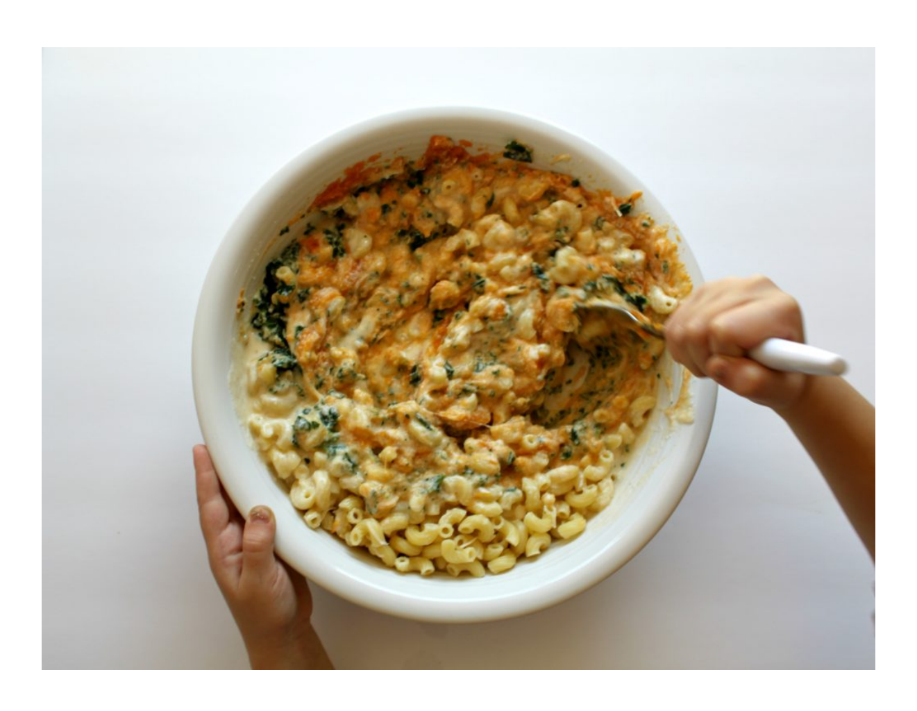
mini Pumpkin and Kale Mac n' Cheese Pot Pies