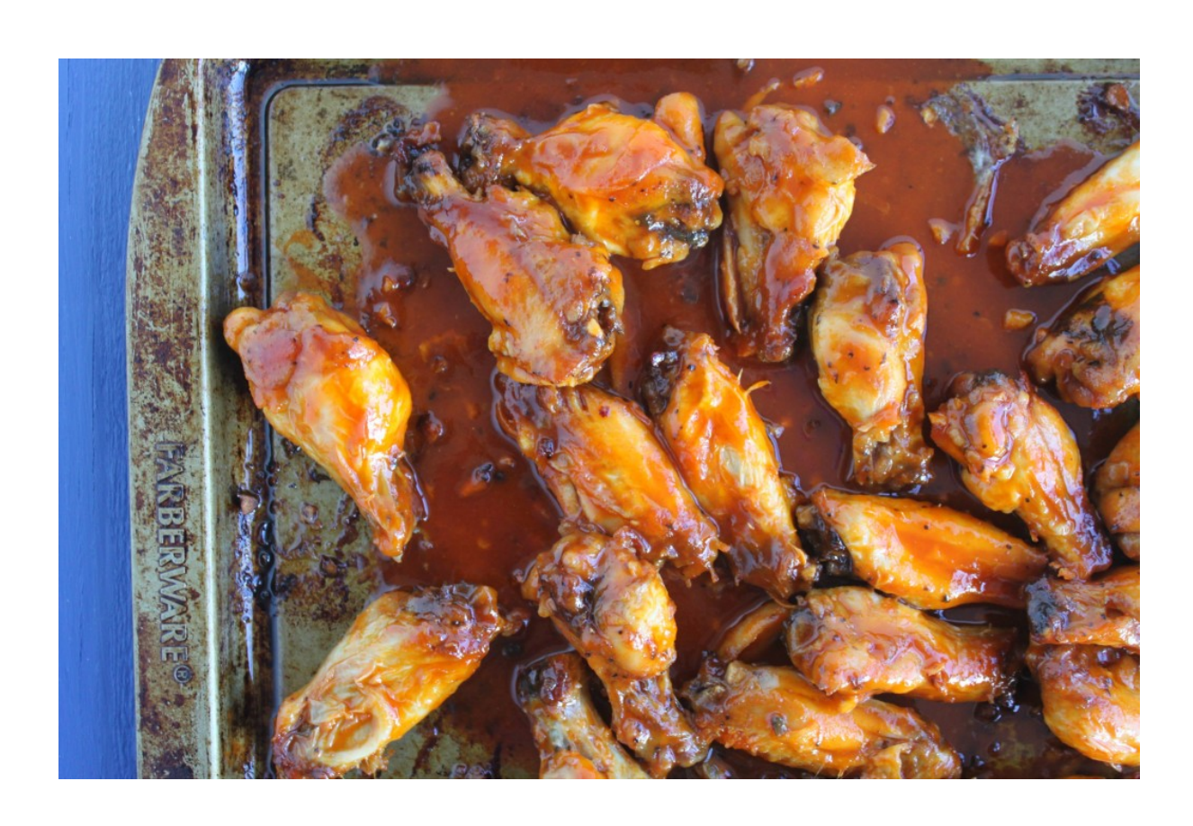
{Baked} Honey Sriracha Chicken Wings