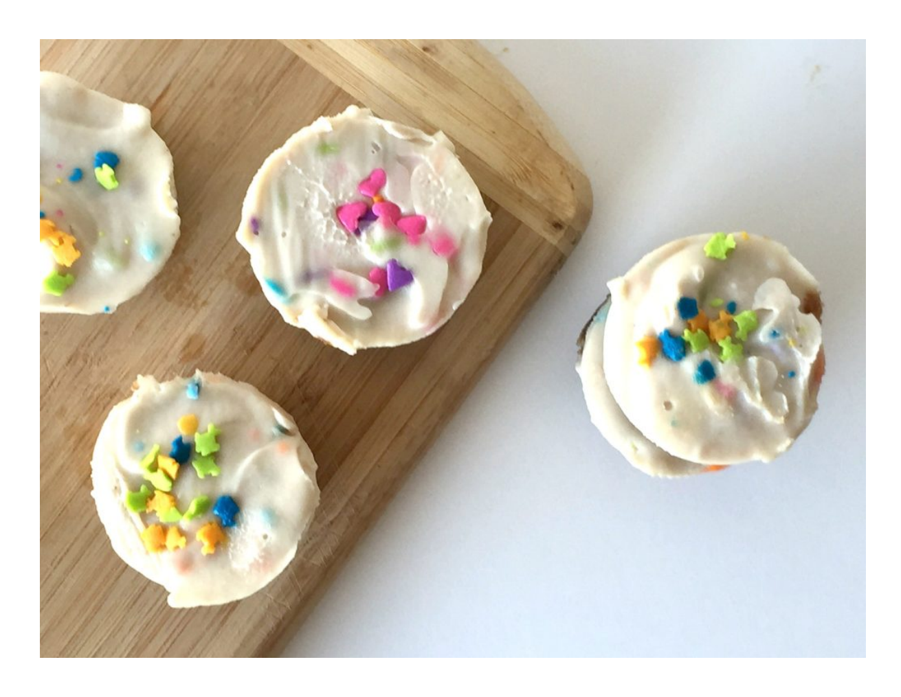
Vegan Funfetti Cheesecake Bites