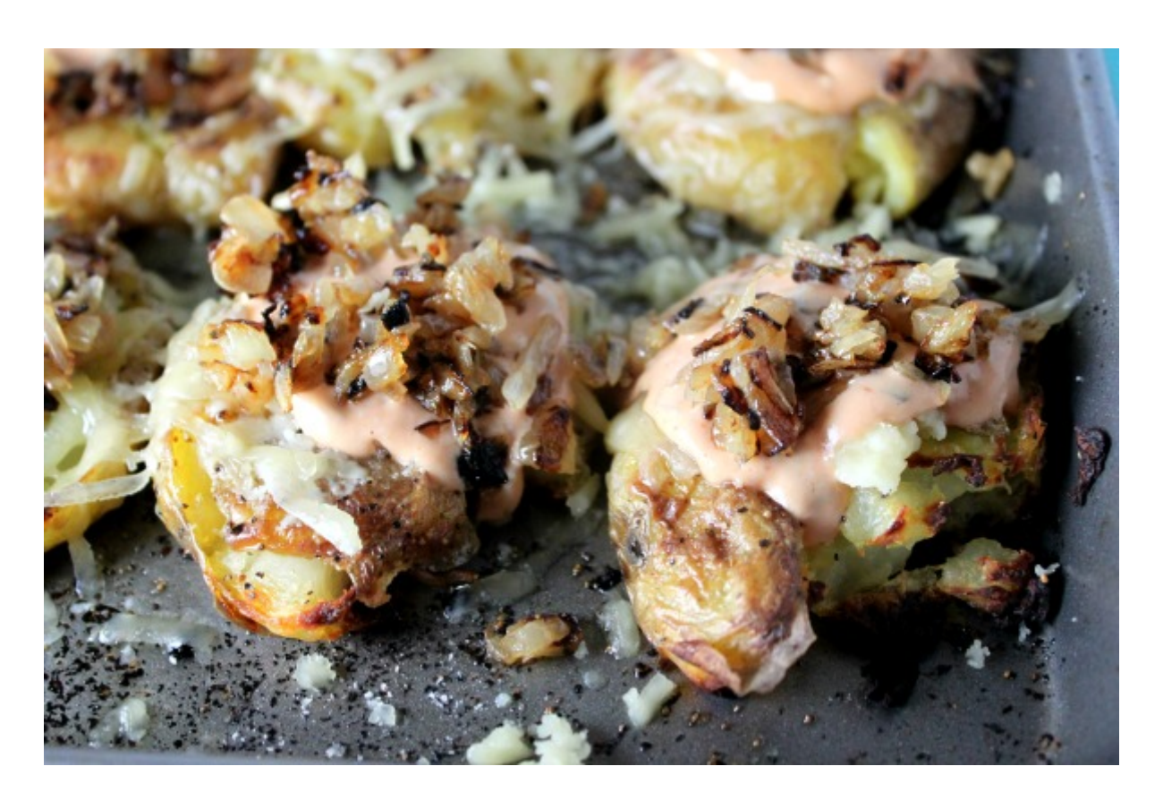
Smashed Potatoes: Animal Style