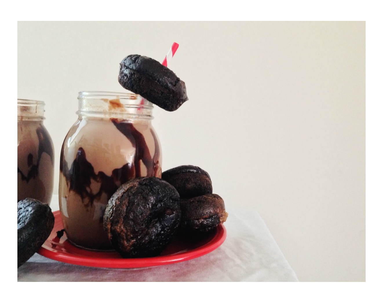
Chocolate Almond Flour Donuts with Egg Creams