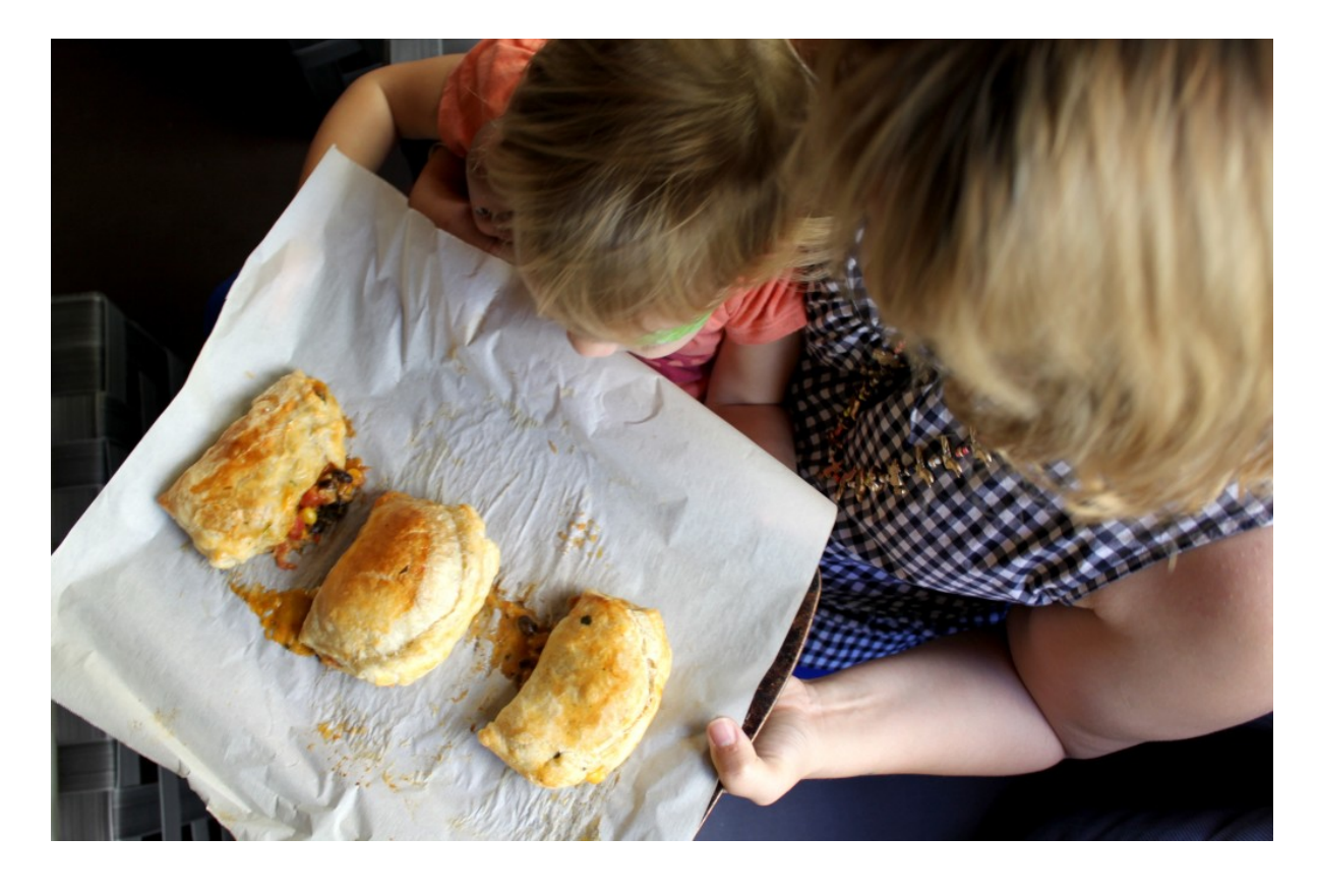
Homemade Black Bean and Cheddar "Hot Pockets"