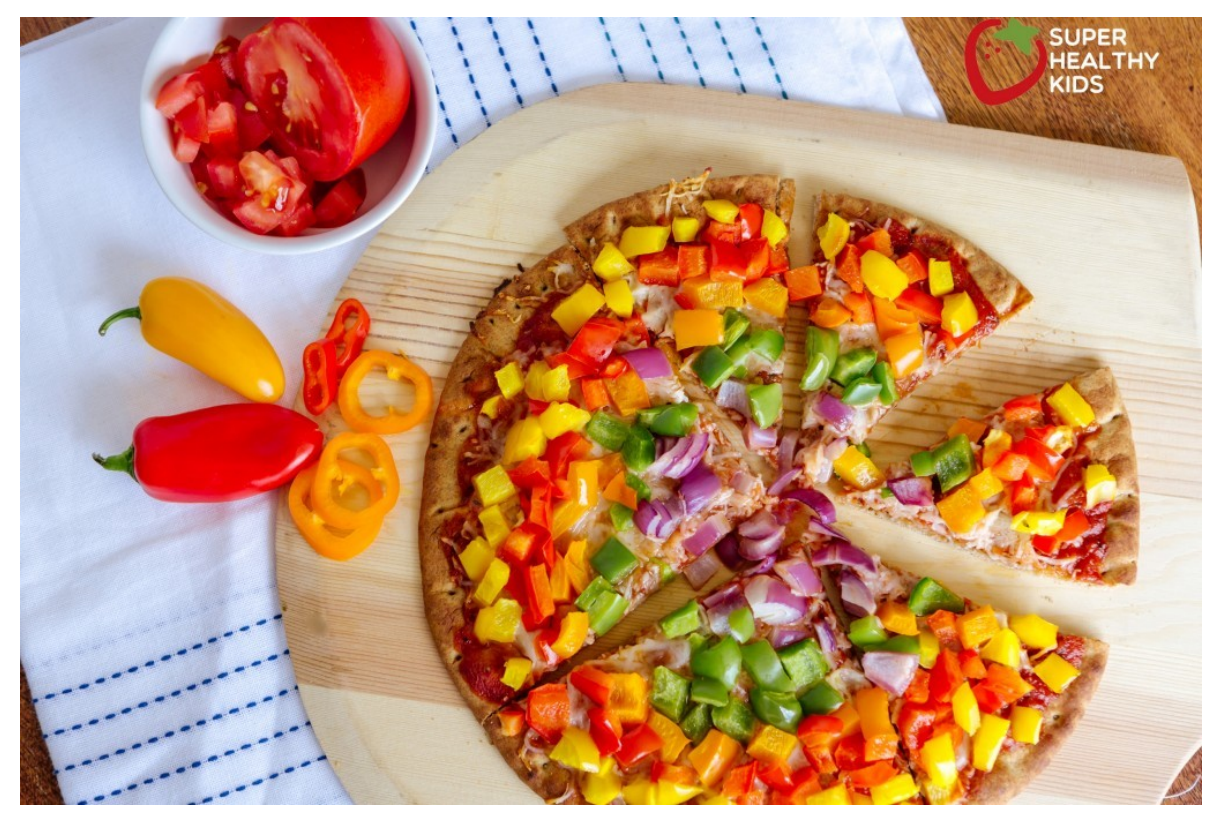
from Super Healthy Kids