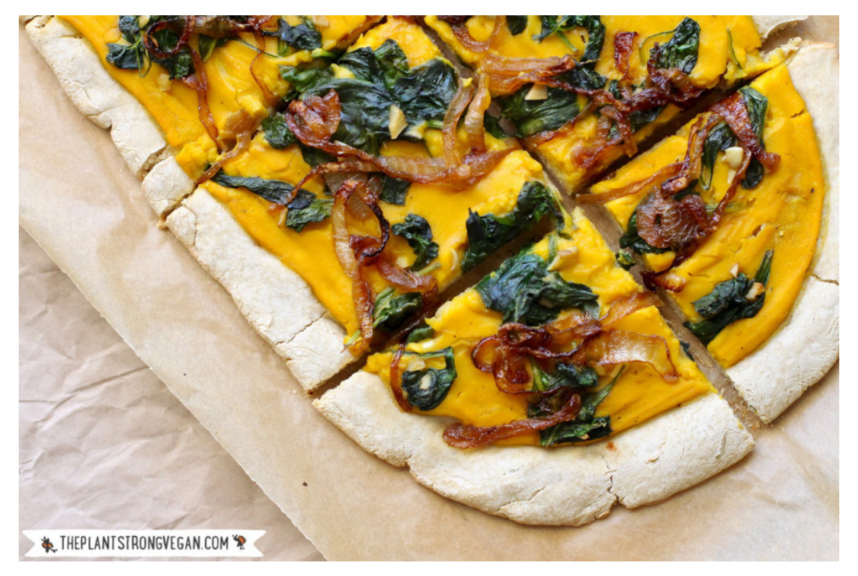
from The Plant Strong Vegan