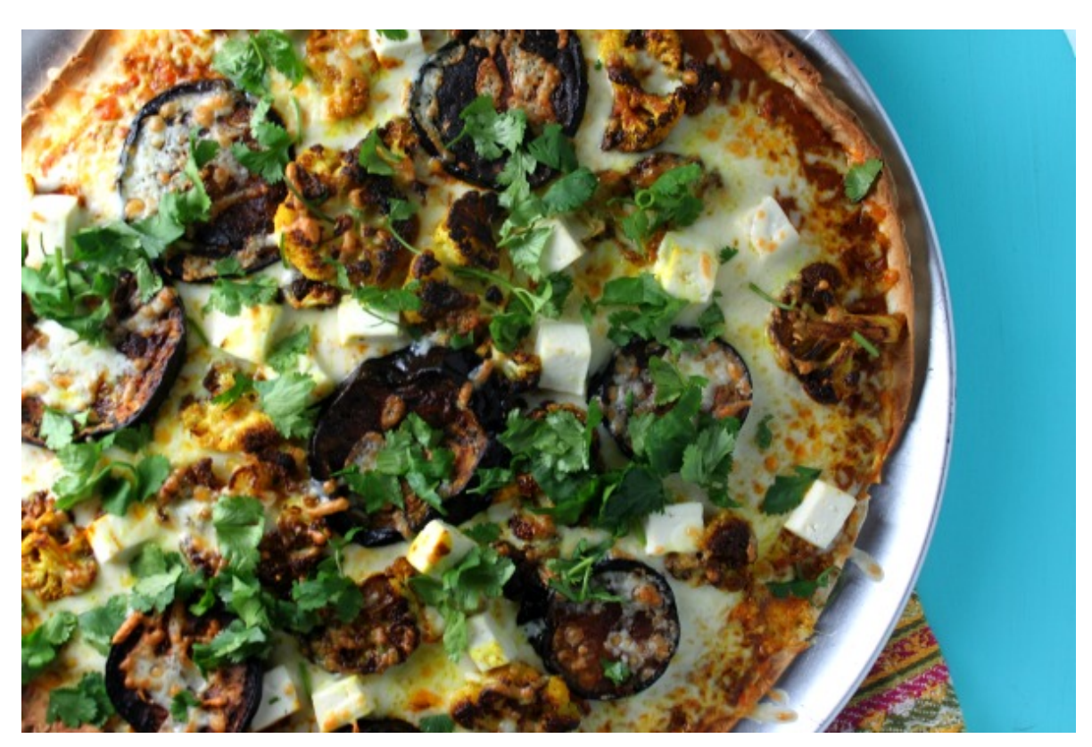
From yours truly, Jewhungry!

1. Curry Pizza with Roasted Cauliflower + Eggplant - Jewhungry