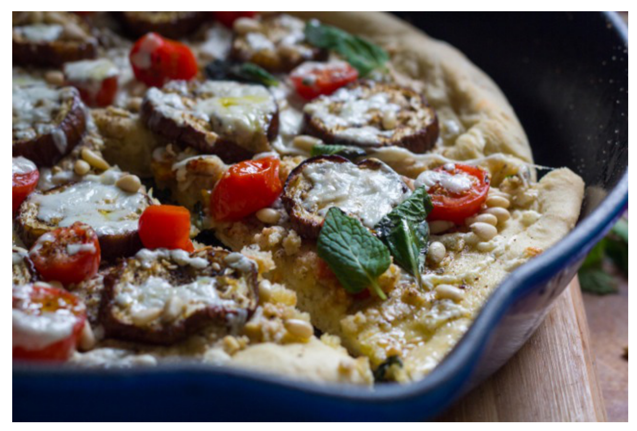
From What Jew Wanna Eat