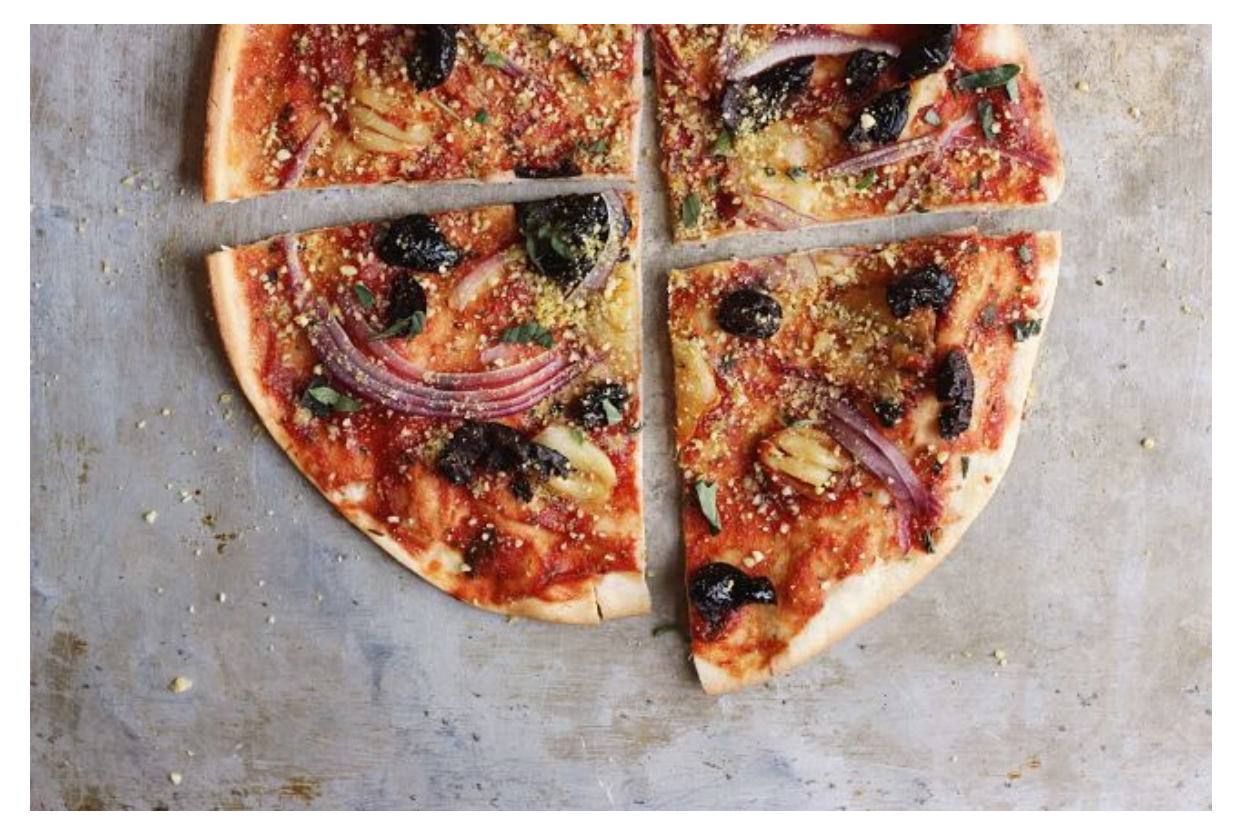
from With Food + Love